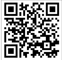
Google Map Direction