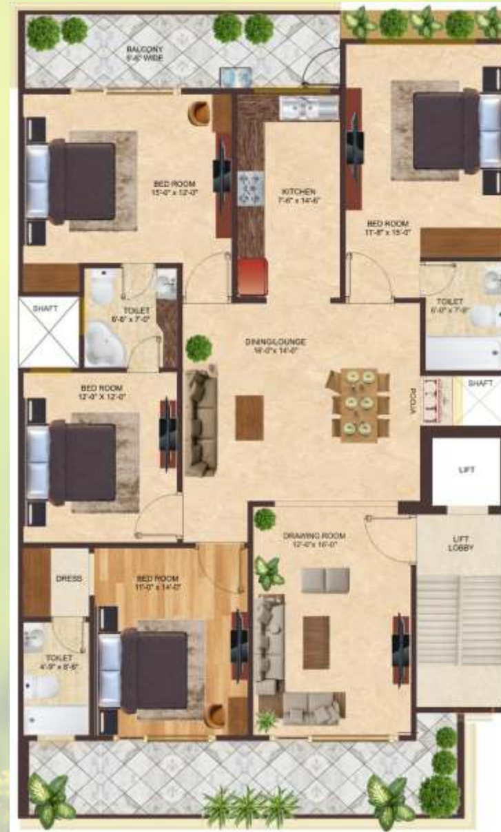
FLOOR PLAN LAYOUT