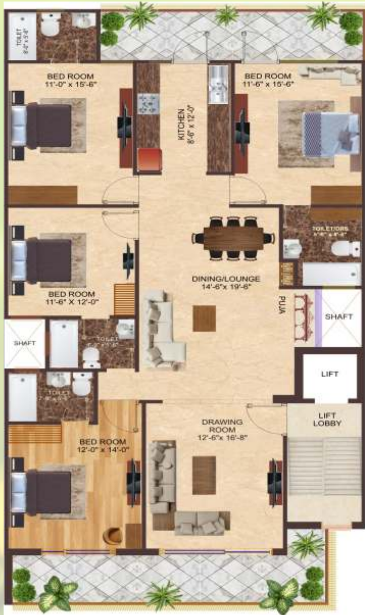
FLOOR PLAN LAYOUT