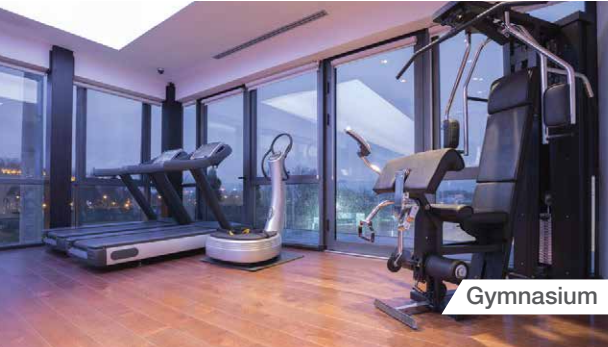
ARTISTIC IMPRESSIONS - indicative in nature and is for general information purpose only.