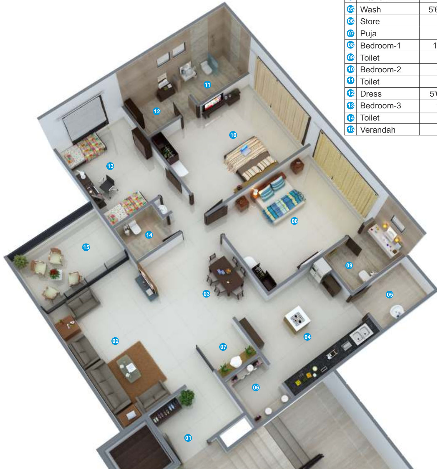
Master Section View | 3 BHK | Block - A & C