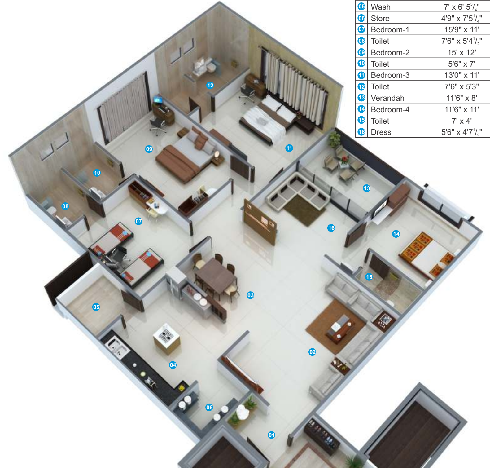
Master Section View | 4 BHK | Block - B