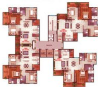
BLOCK - A