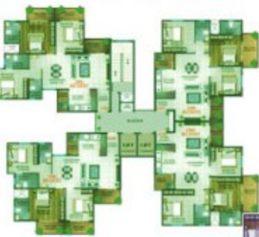
BLOCK - B