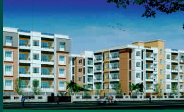
ICON Old Mahabalipuram Road, Chennai