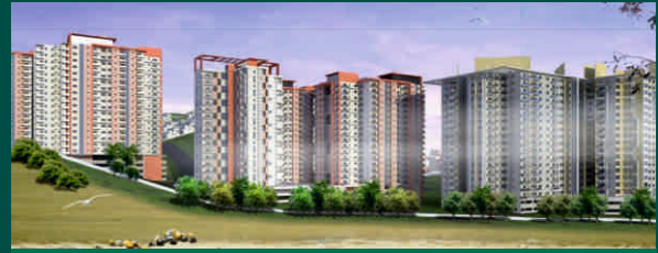
PANORAMA HILLS (GLOBAL ENTROPOLIS) Vizag

Sole Marketing Partner for KSR BASIL RAMS Innovative Solutions LLP RERA Registration No : PRM/KA/RERA/1251/309/AG/180605/000940