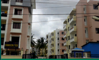
CRIMSON TIDE R. T. Nagar, Bangalore