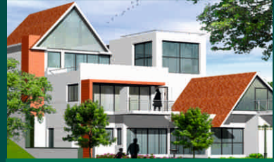
SUNNY ISLES Vizag, Andhra Pradesh