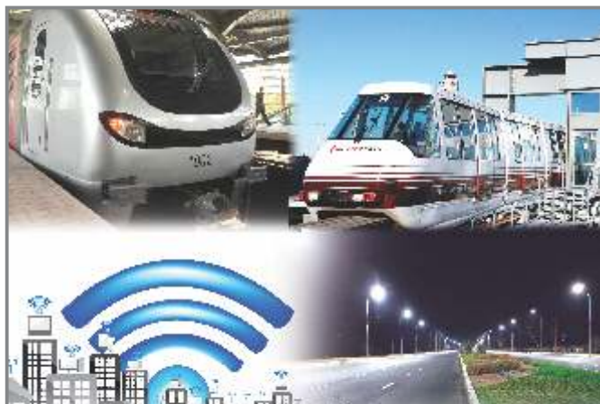
Part of declared "Smart City"