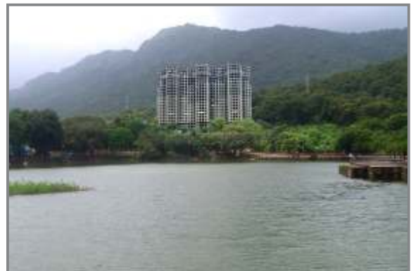
Situated between natural lake & hill