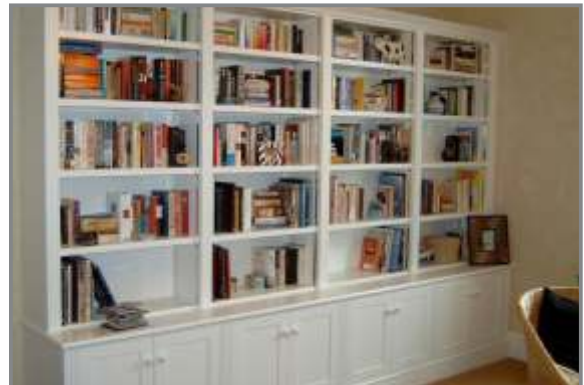
Exclusive spiritual library with prayer room