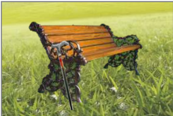
Senior citizen herbal garden