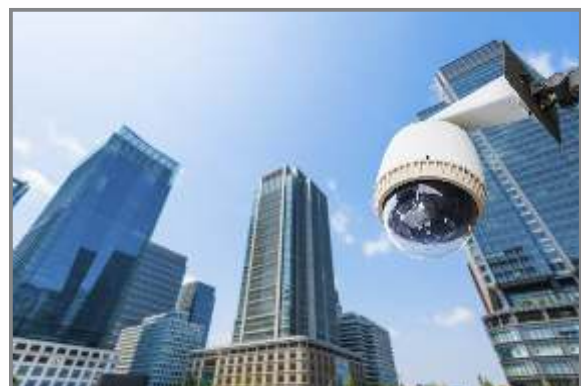
24x7 Advanced security systems