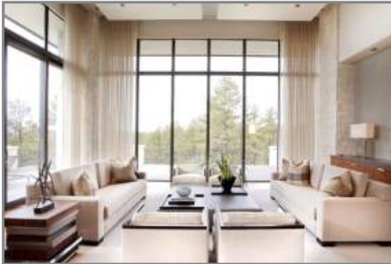
10' 3" Floor height for better sunlight & air ventilation