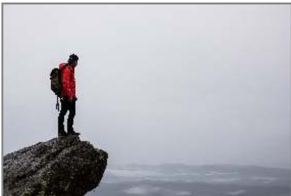
Natural higher ground level compare to other areas