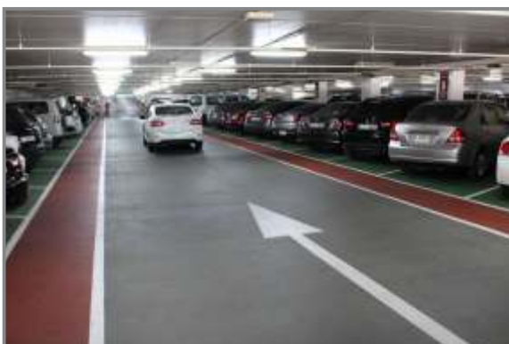
Spacious multi level car parking