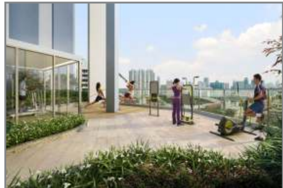
Well equipped open gym on terrace