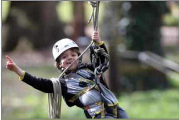
Adventure activity centre