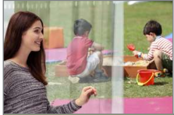
Kids park under your observation