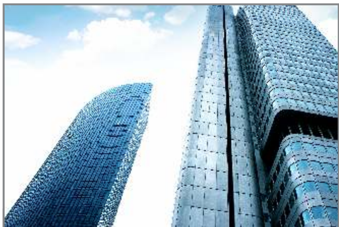
Part of MMR's declared Growth Center