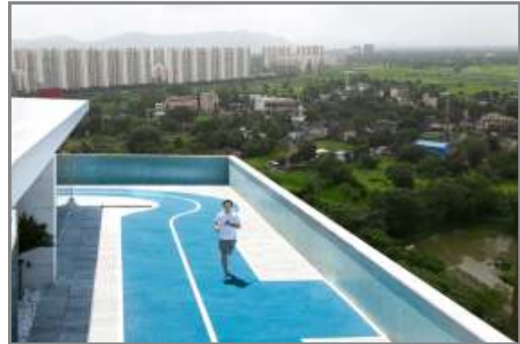
Jogging track with musical lawn on terrace