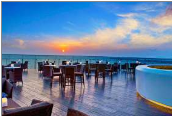
Modern sky lounge with sun deck