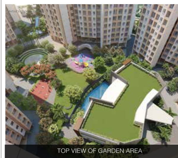
TOP VIEW OF GARDEN AREA