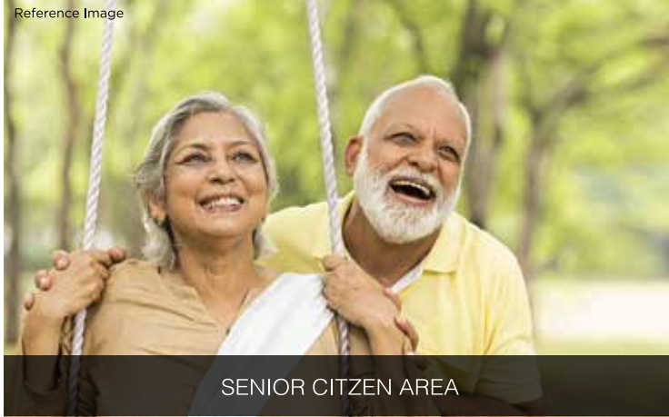
SENIOR CITIZEN AREA