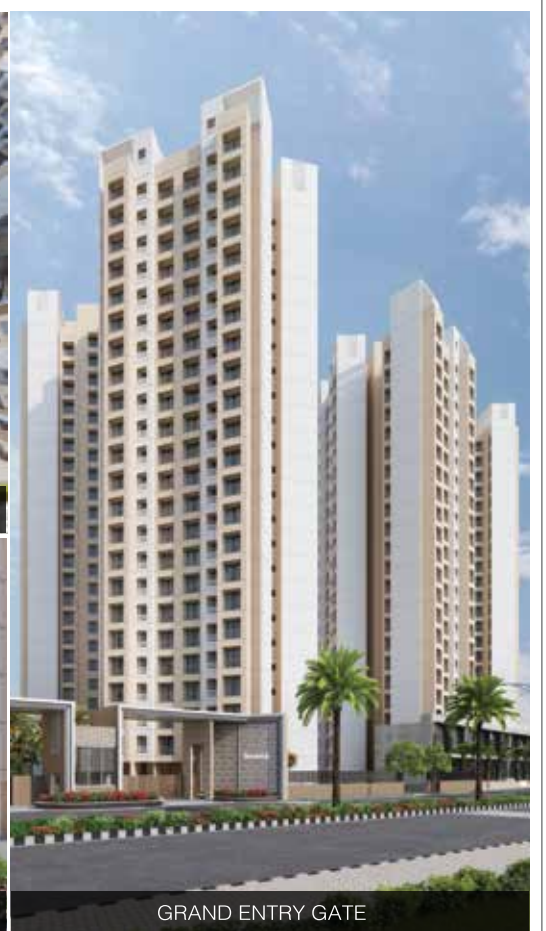
GRAND ENTRY GATE