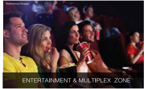
ENTERTAINMENT & MULTIPLEX ZONE