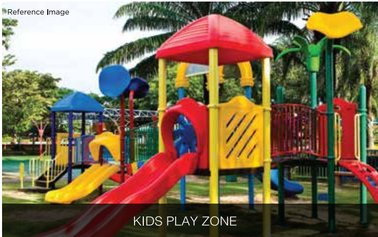
KIDS PLAY ZONE