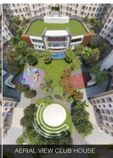
AERIAL VIEW CLUB HOUSE