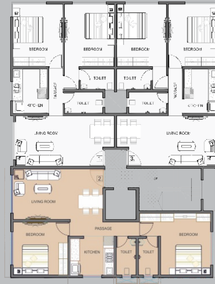
Isometric Plan of 2 BHK Type 2 63.08 sq.mt. (679 sq.ft.)