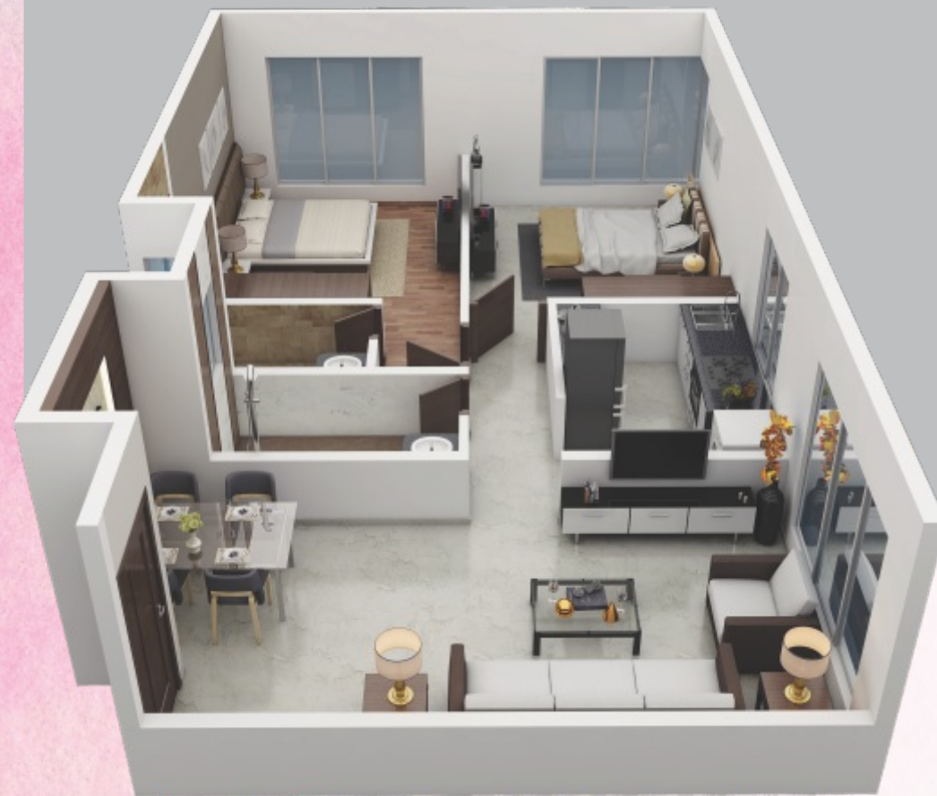
Isometric Plan of 2 BHK Type 3 63.17 sq.mt. (680 sq. ft.)