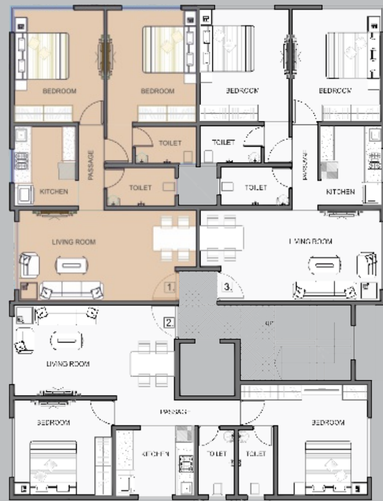
Isometric Plan of 2 BHK Type 1 63.08 sq.mt. (679 sq.ft.)