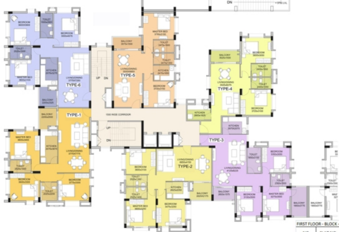
FIRST FLOOR - BLOCK - A & F