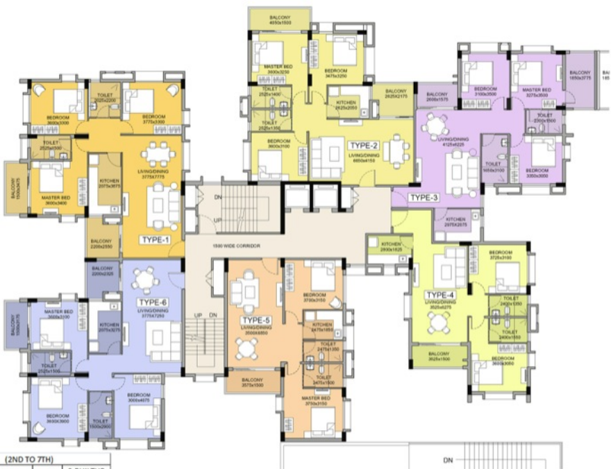
Typ. Floor - Block - F (2ND TO 7TH)