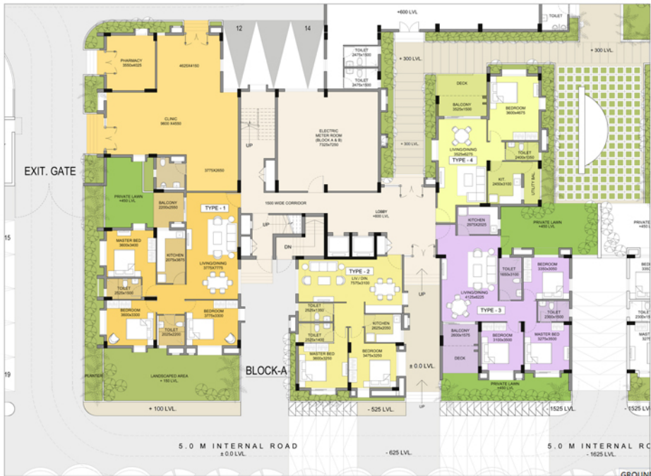
GROUND FLOOR PLAN GANGA GREENS - BLK - A