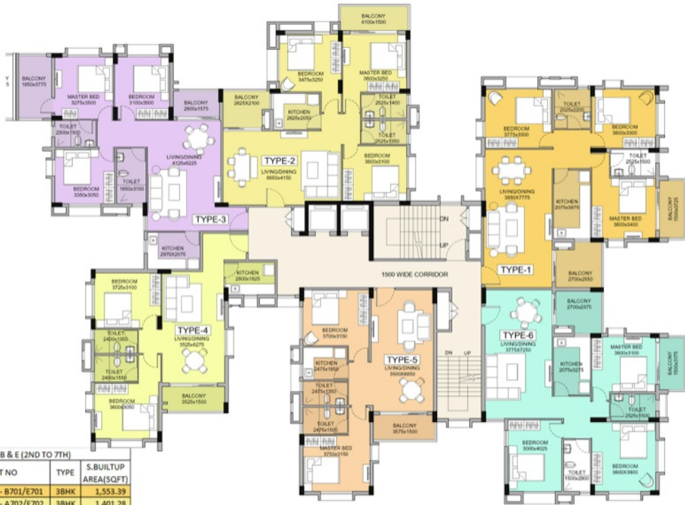
TYP. FLOOR - BLOCK - B & E (2ND TO 7TH)