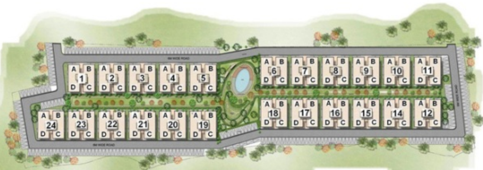
IV GREENS - PLOT PLAN