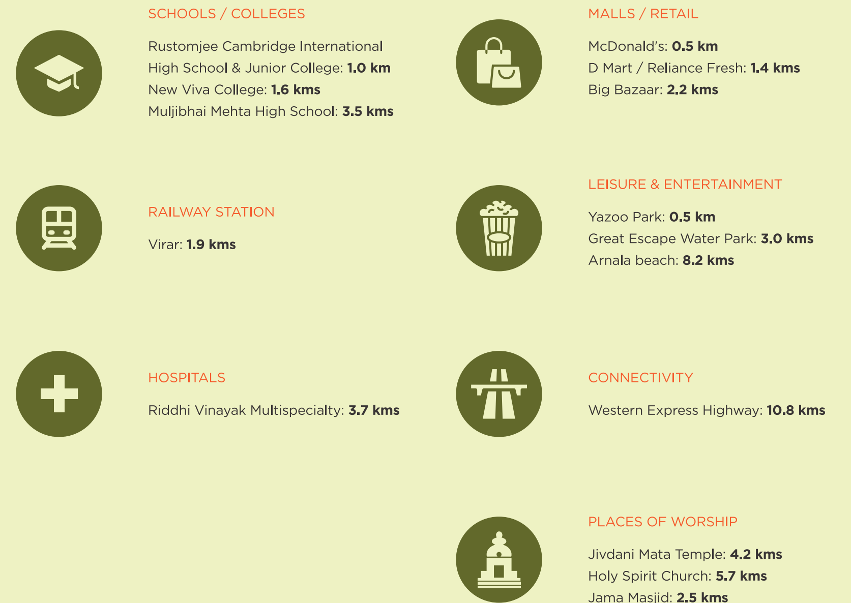
Disclaimer: All distances are approximate.