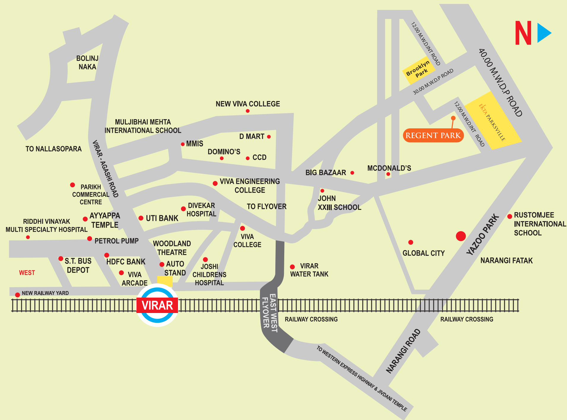
Location plan not to scale