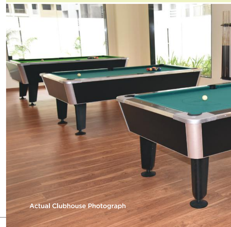
Actual Clubhouse Photograph