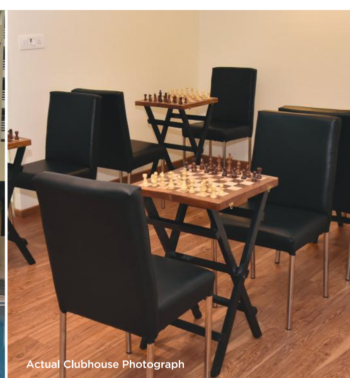
Actual Clubhouse Photograph