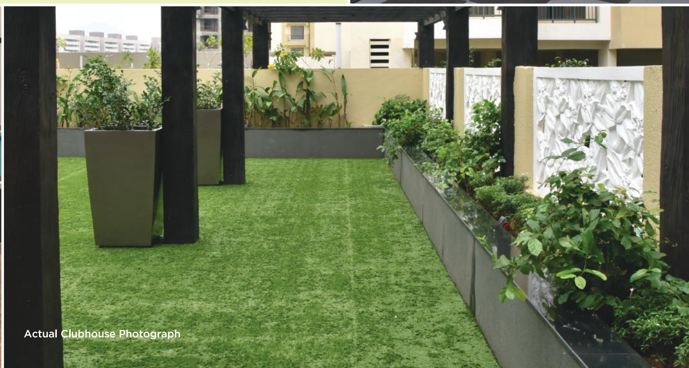
Actual Clubhouse Photograph