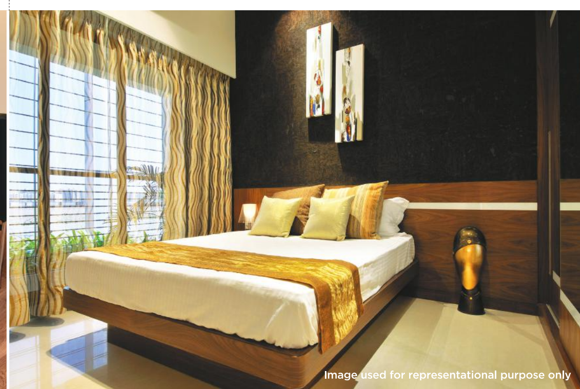
Image used for representational purpose only