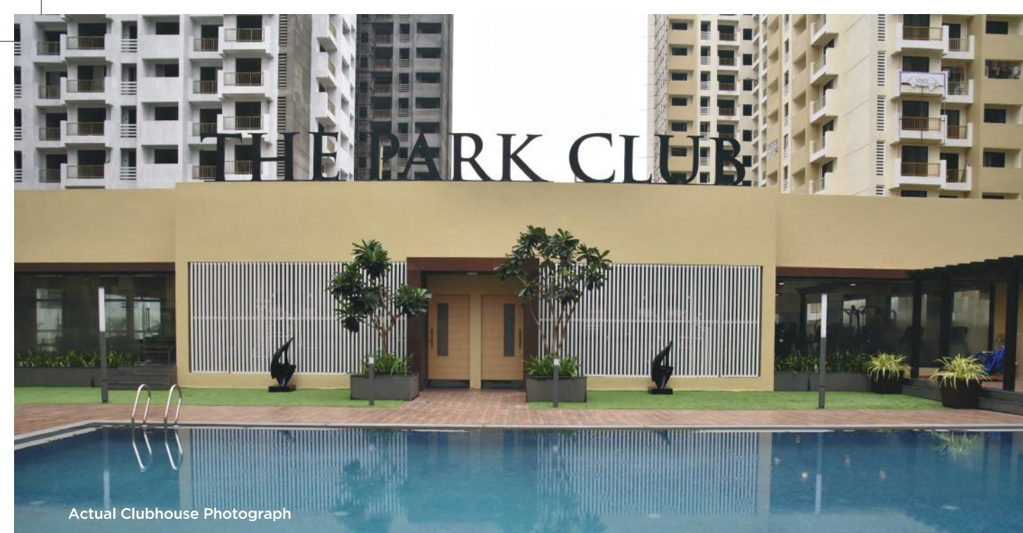
Actual Clubhouse Photograph