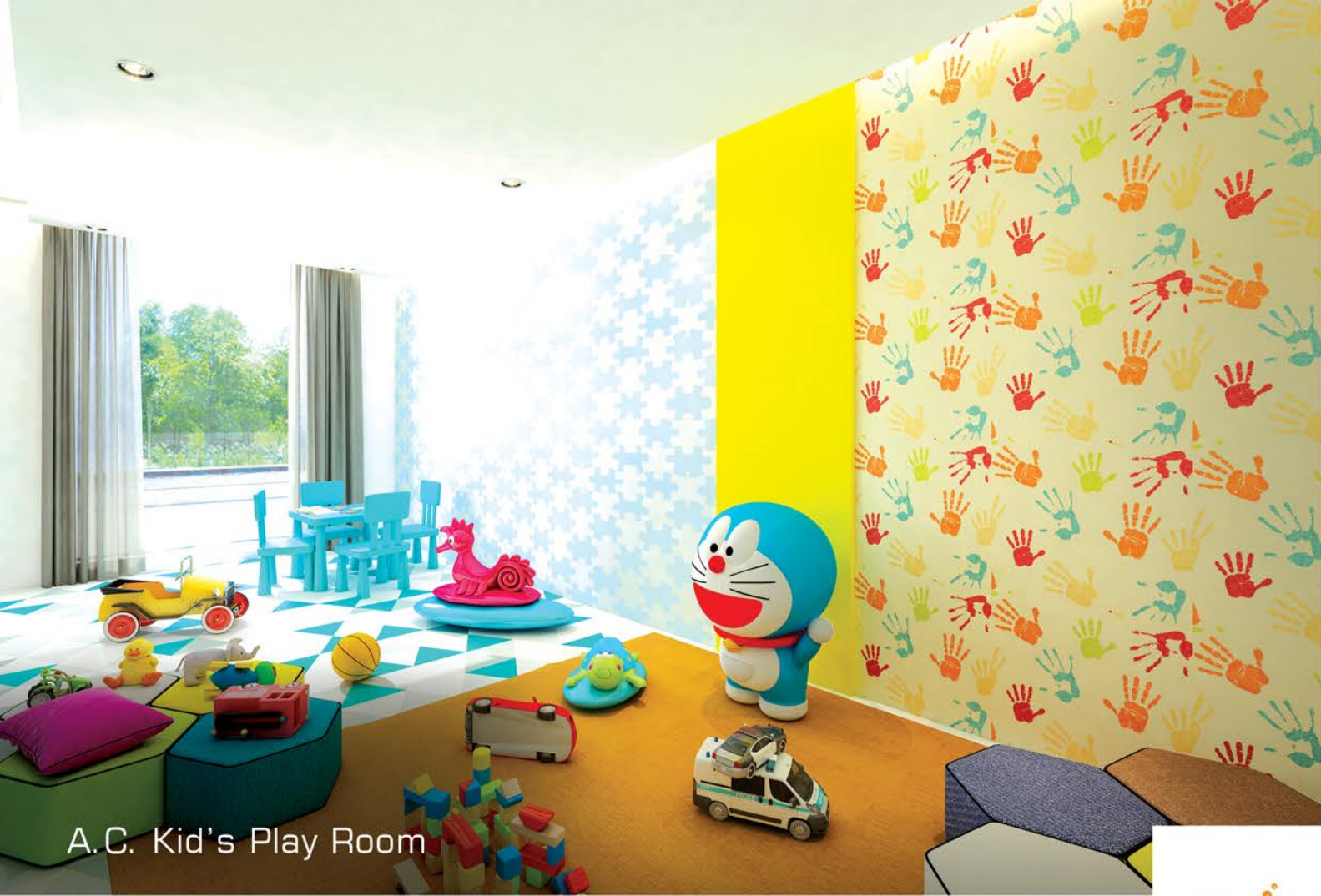
A.C. Kid's Play Room