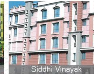
Siddhi Vinayak Ballygunge Place, Kolkata