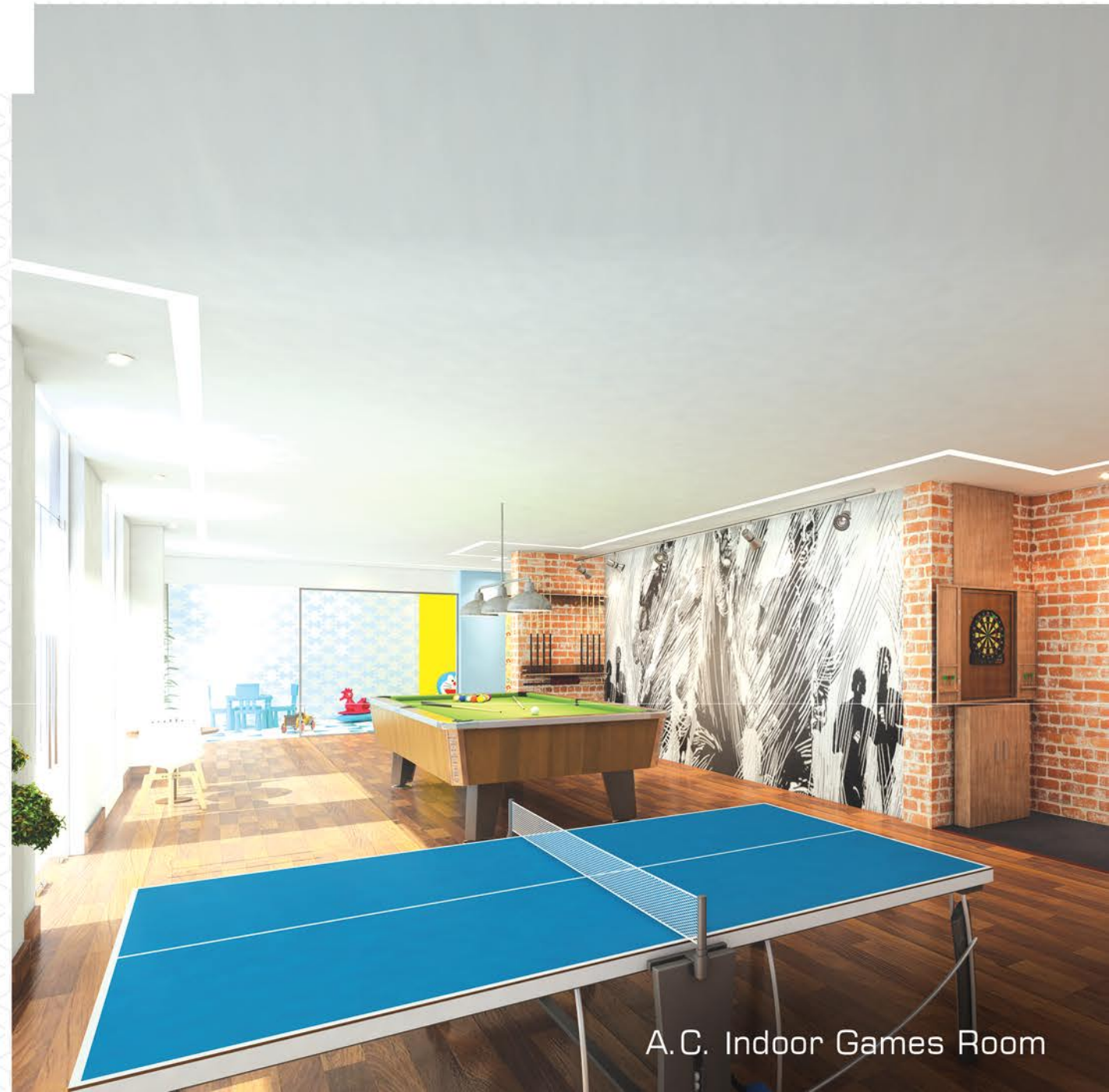
A.C. Indoor Games Room