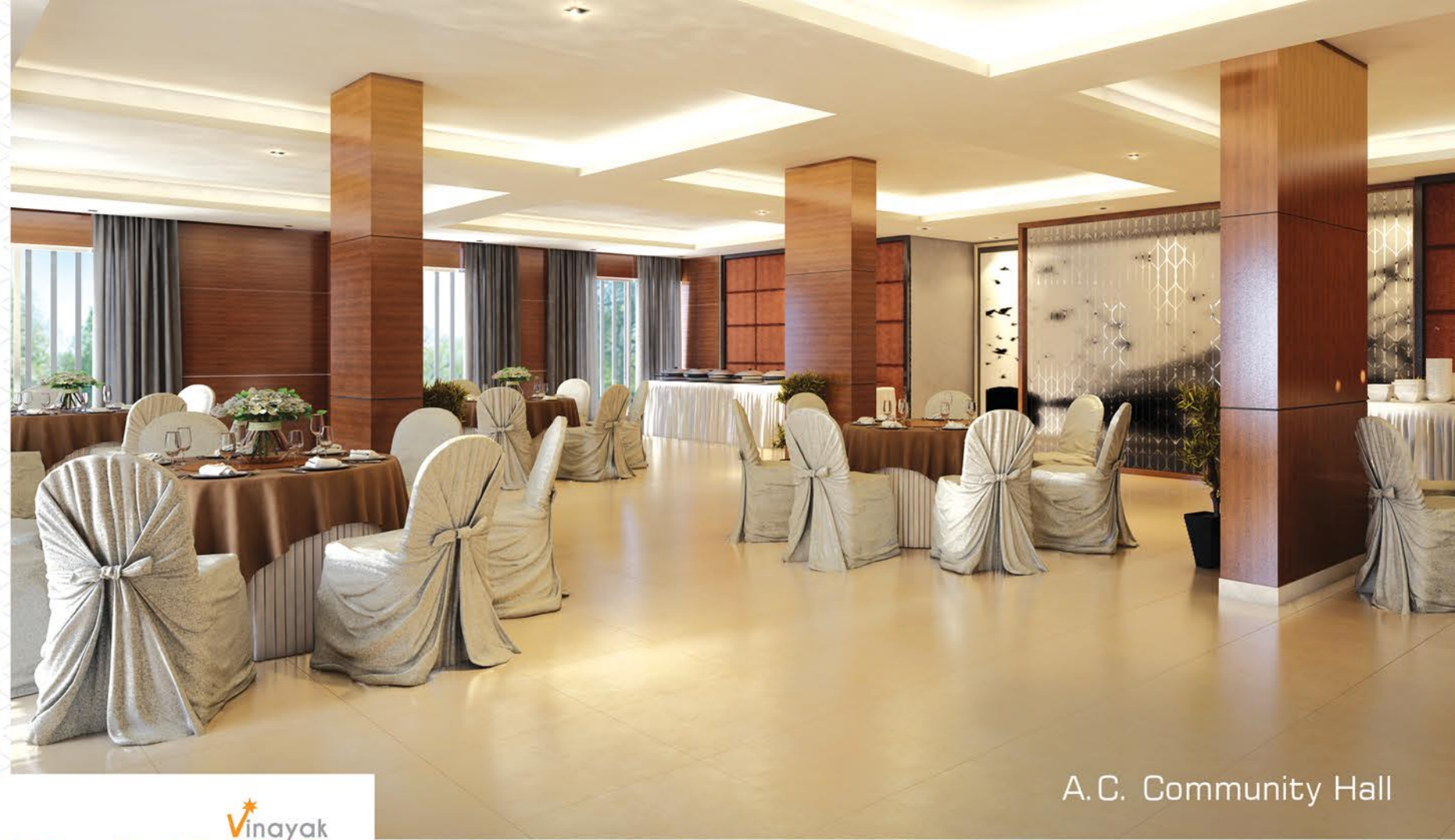
A.C. Community Hall