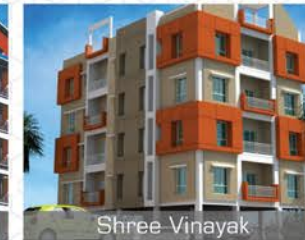
Shree Vinayak Kankurgachi, Kolkata