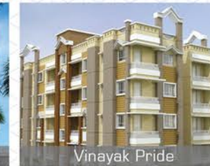
Vinayak Pride Garia, Kolkata