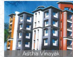
Asta Vinayak Lake Town, Kolkata