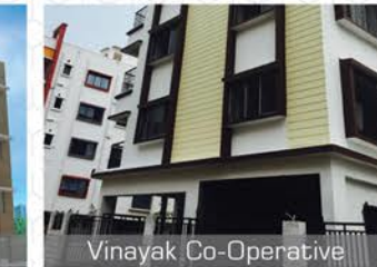
Vinayak Co-Operative Newtown, Kolkata