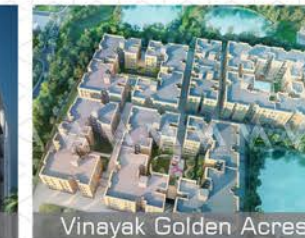
Vinayak Golden Acres Konnagar, Hooghly