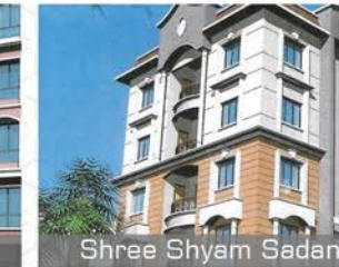
Shree Shyam Sadan VIP Road, Kolkata