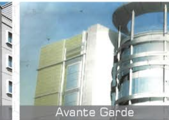
Avante Garde Newtown, Kolkata