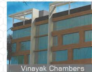
Vinayak Chambers Pollock Street, Kolkata