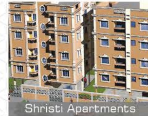
Shristi Apartments Kadapara, Kolkata