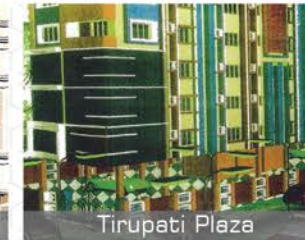
Tirupati Plaza AJC Bose Road, Kolkata