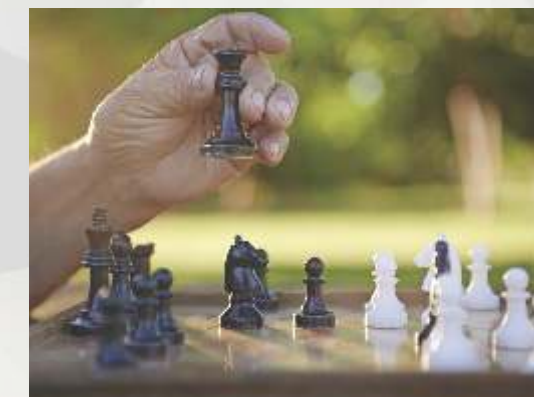
Luxurious Club House