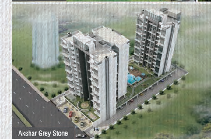
Akshar Grey Stone