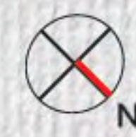
3 BHK SMALL