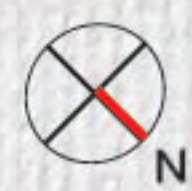
13th Floor Plan