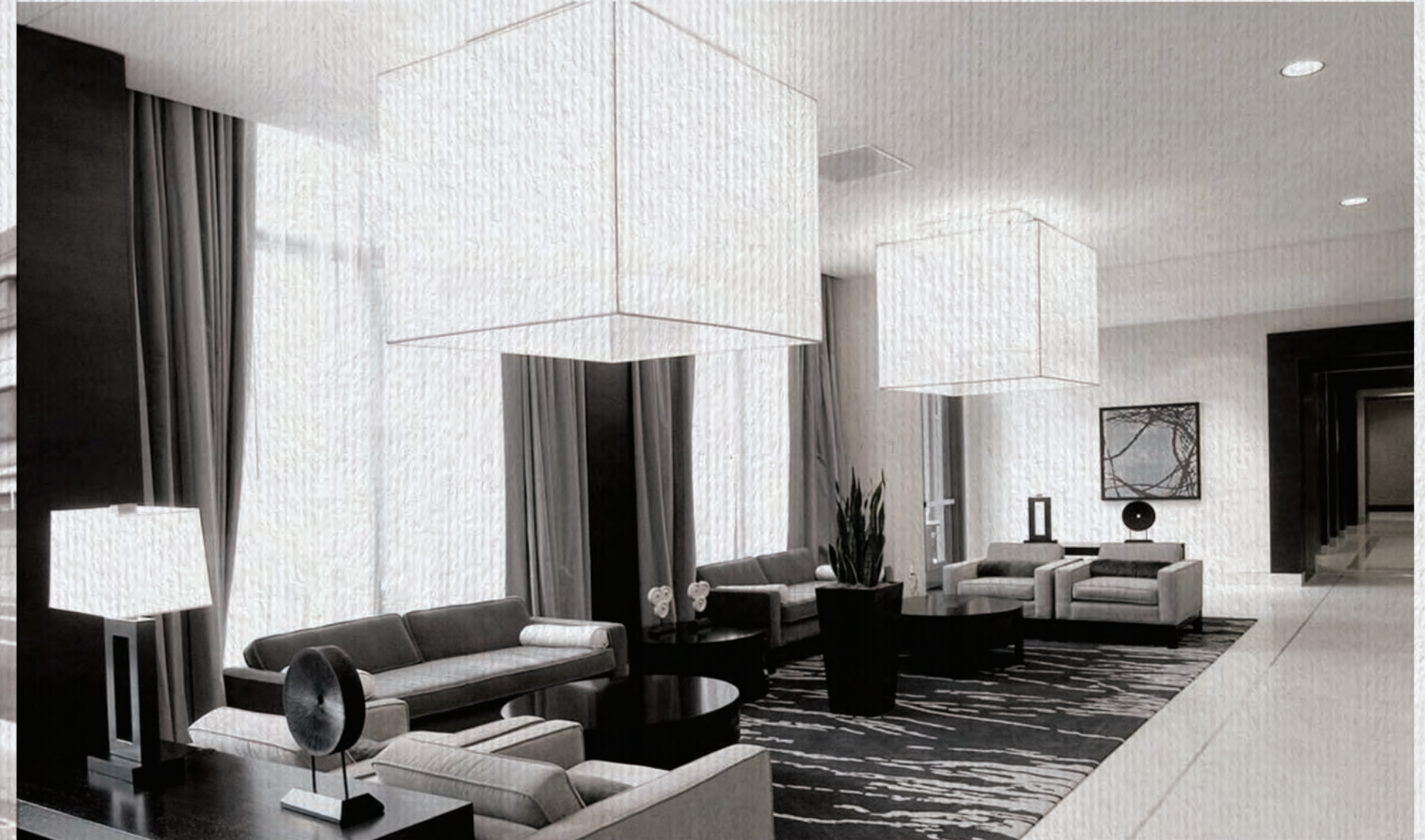
Designer lobby with ambient music

Elegance, Grace and finesse, All set to compliment you grand arrival.