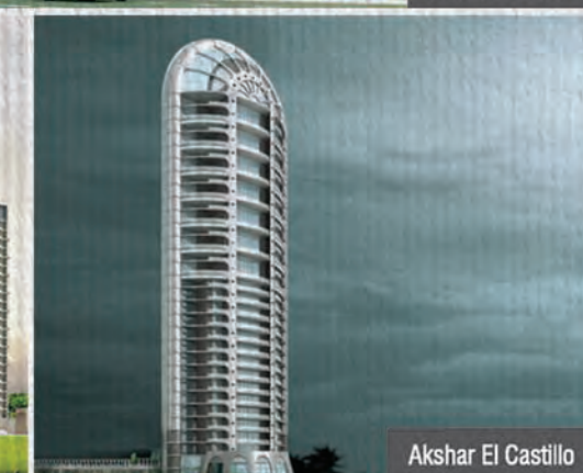
Akshar El Castillo

Our completed projects : Shreeji Heights, Sai Radiance, City Centre, Proxima, Valencia