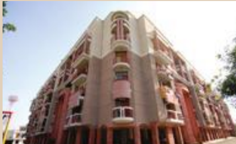
Trimurty Apartment Malviya Nagar, Jaipur