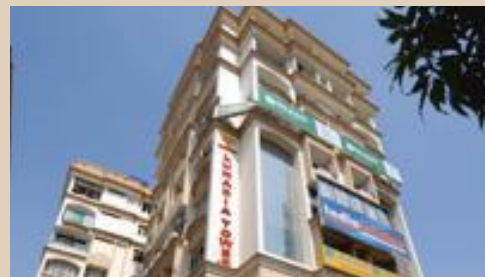
Trimurty Luhadia Towers C-Scheme, Jaipur