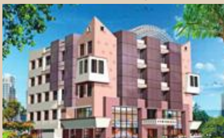
Krishna Enclave Tonk Road, Jaipur