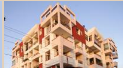
Trimurty's Apna Aangan Bani Park Jaipur