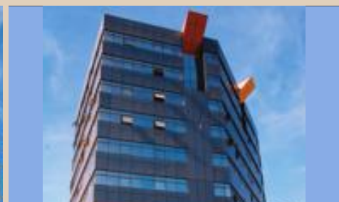
Trimurty V - JAI City Point Ahimsa Circle, Jaipur