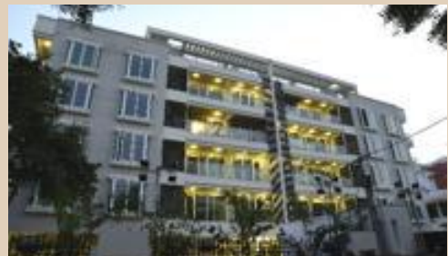
Hari Niwas, 3 & 4 BHK Apartments, Banipark, Jaipur