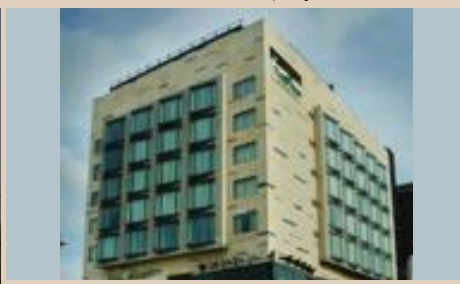
The Fern (An Ecotel Hotel) Tonk Road, Jaipur