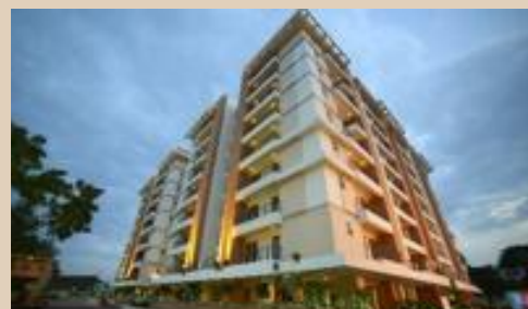
Kohinoor Garden-Studio, 1, 2, 3 & 4 BHK Apartments, New Sanganer Road, Jaipur