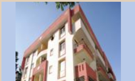
Trimurty Natraj Apartment M D Road, Jaipur