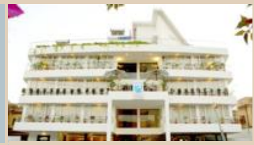
The Wallstreet (A Business Hotel) New Colony, Jaipur