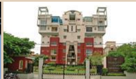
Trimurty Dave Apartment Bani Park, Jaipur