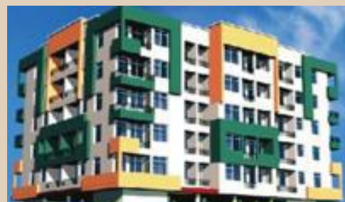
Trimurty Apartments Hiran Magri, Udaipur