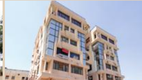
Geeta Enclave C-Scheme, Jaipur