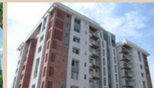
Aurum, C-Scheme, Jaipur