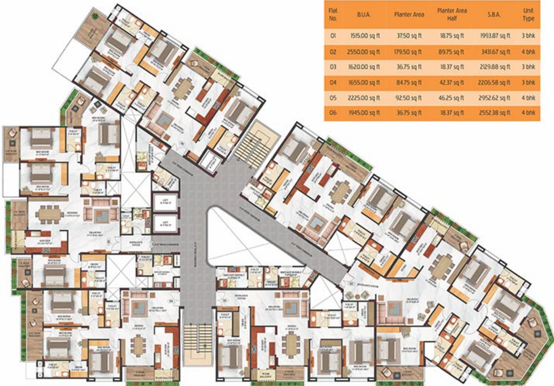
TYPICAL FLOOR PLAN ( 3, 5, 7, 9 & 11 )