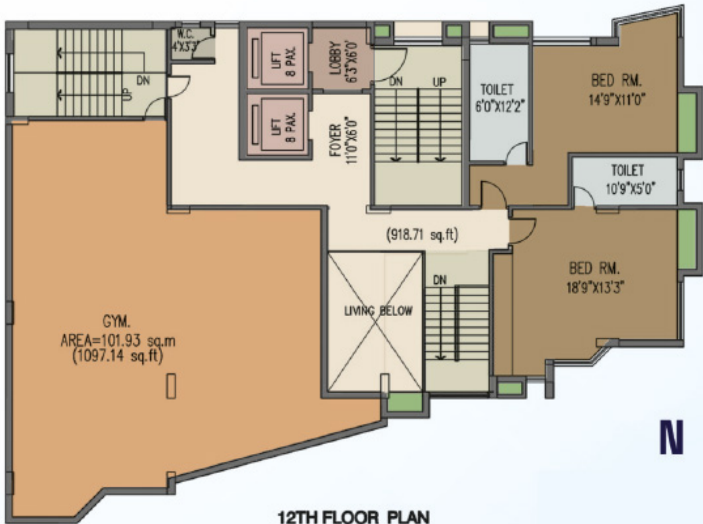
12TH FLOOR PLAN