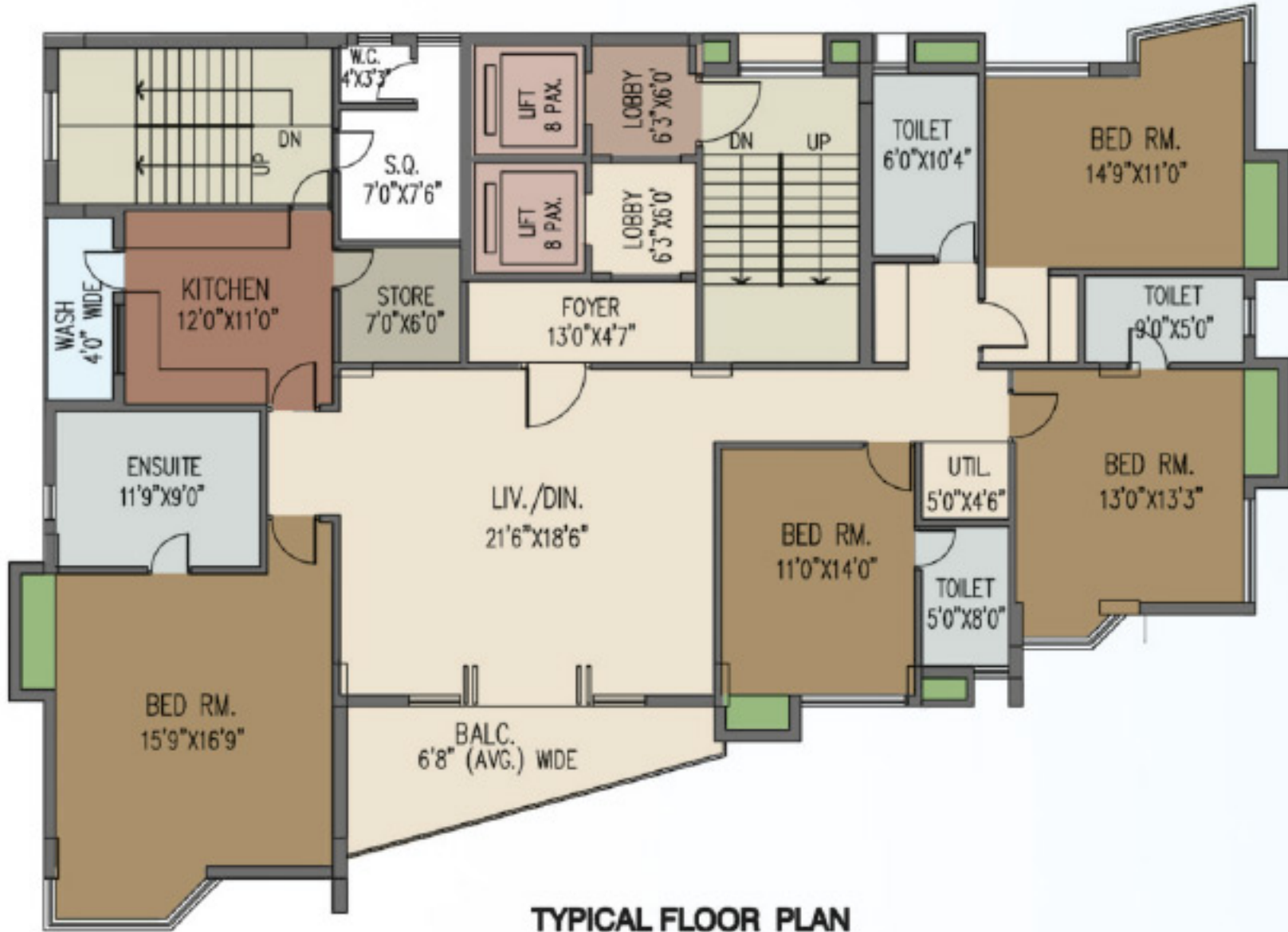
TYPICAL FLOOR PLAN (2ND TO 10TH FLOOR)