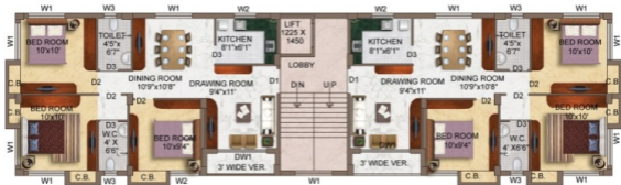
TYPICAL 1ST TO 4TH FLOOR PLAN