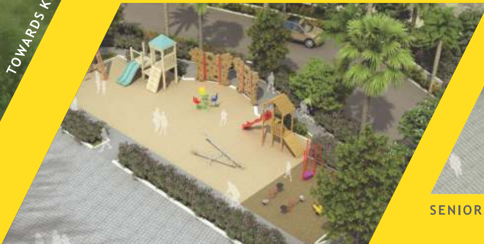
TODDLERS' & CHILDREN'S PLAY ARENA