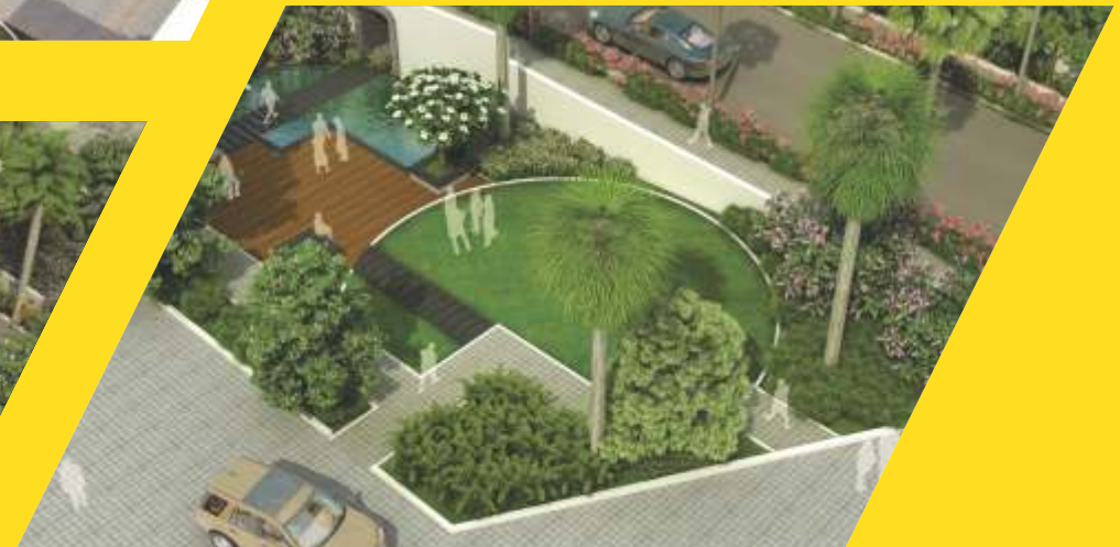
SENIOR CITIZENS' DECK