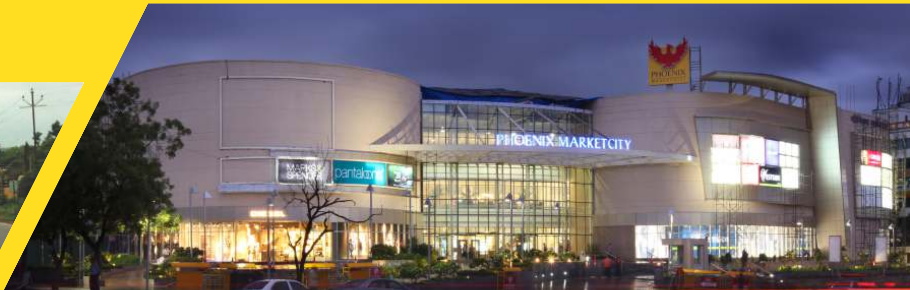
LANDMARK DESTINATIONS AROUND HILL SHIRE