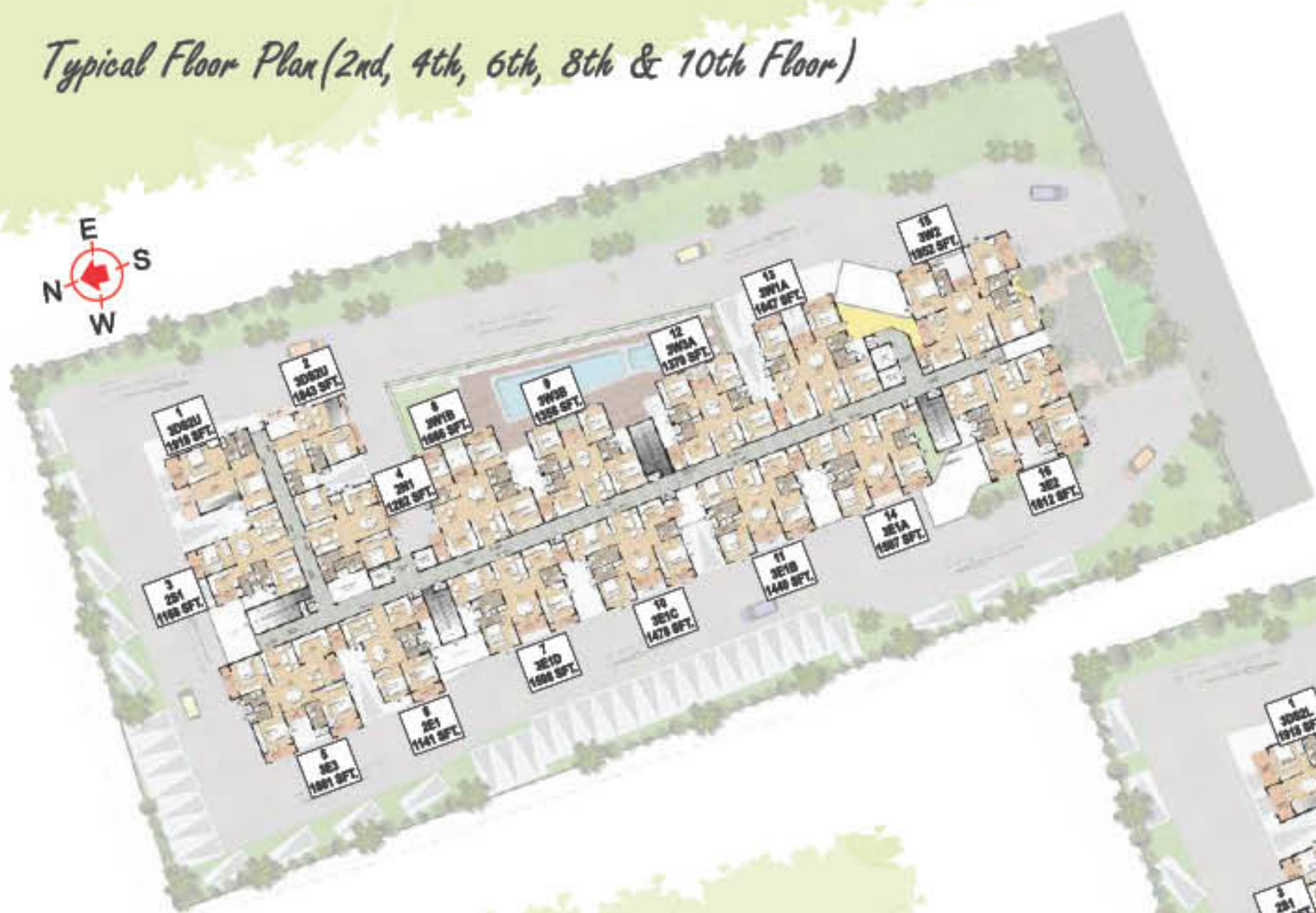
Typical Floor Plan (2nd, 4th, 6th, 8th & 10th Floor)