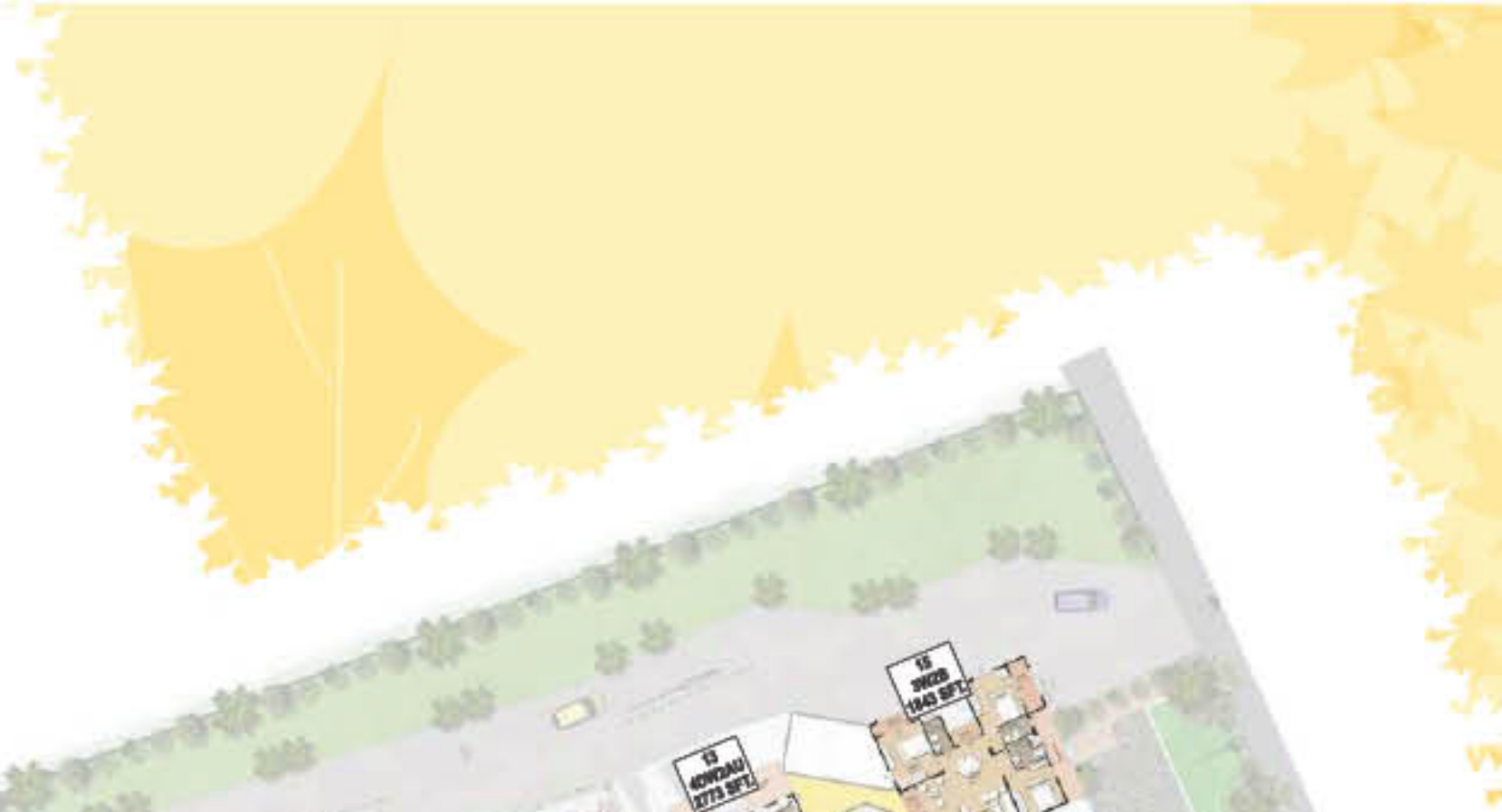
Typical Floor Plan (12th Floor)