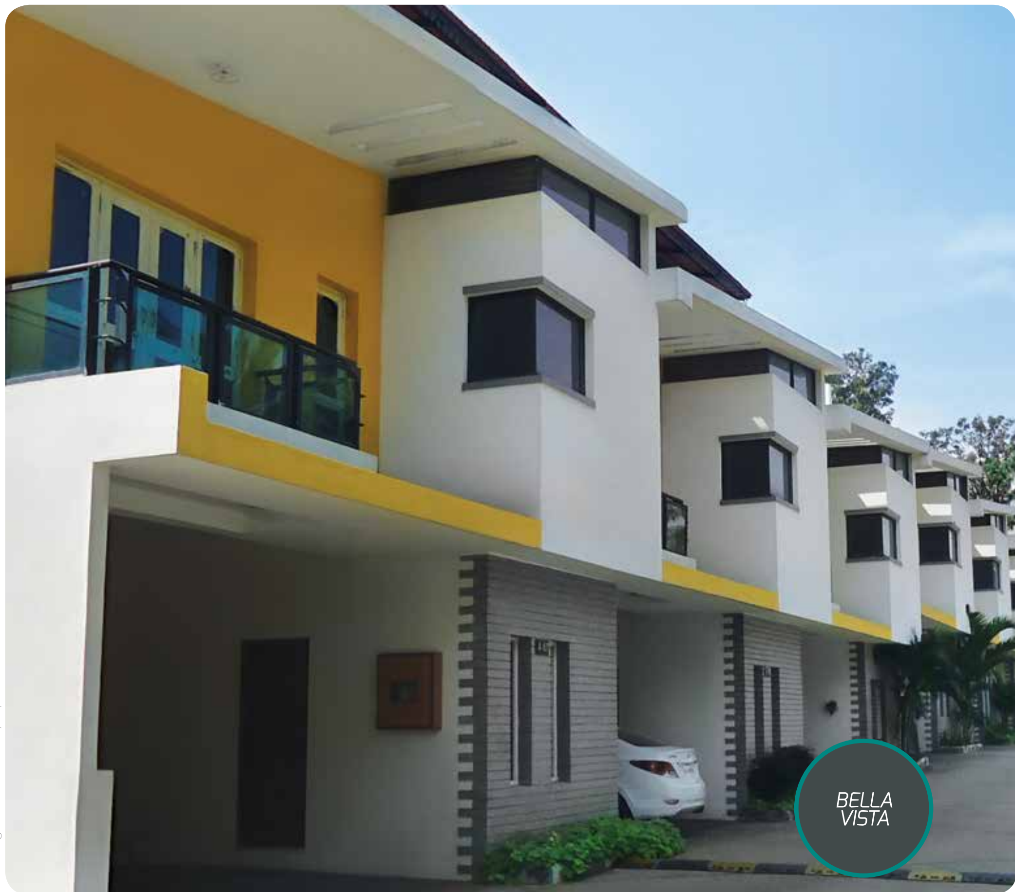
A gated community of 4 bedroom luxury villas off Brookefields, Bangalore, with stunning amenities and facilities.

The Villas at Walnut Creek have a rich legacy behind them. It is a legacy shared by Bella Vista and Whispering Palms, the most recent villa projects from Vaswani Group.