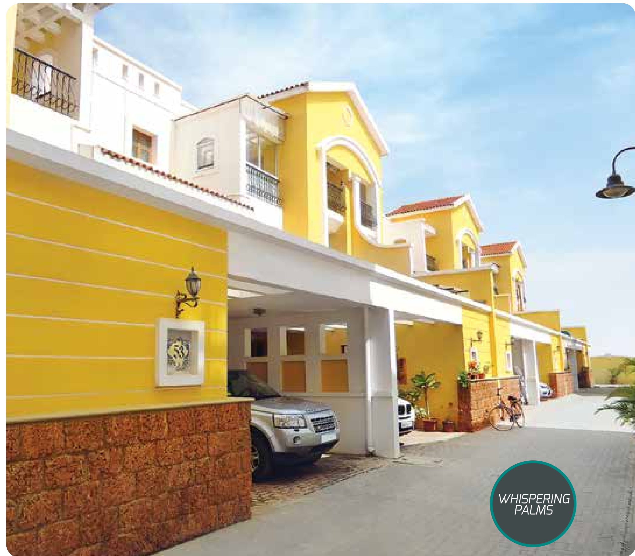
A Portuguese inspired gated community of luxurious 3 and 4 bedroom villas just off Sarjapur Ring Road. The best residential property of the year - CMO Asia Council.

* Images shown are only representational