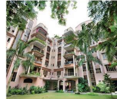
Heritage Mayfair | Ballygunge