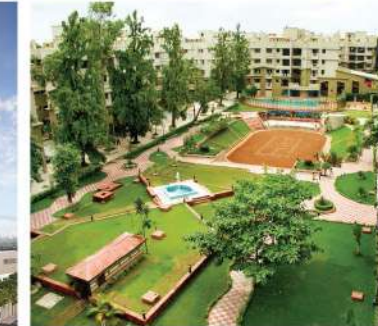
Sherwood Estate | Narendrapur