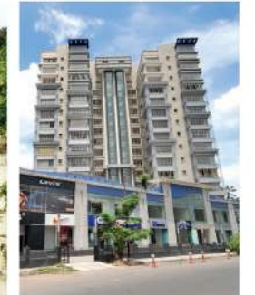
Astral | Ballygunge