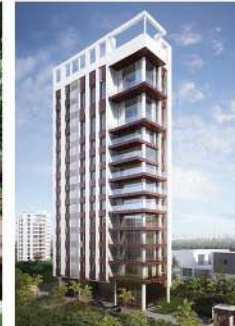
The Unimark Grand | Ballygunge