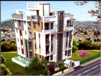
49, Keshav Nagar, Civil lines, Jaipur