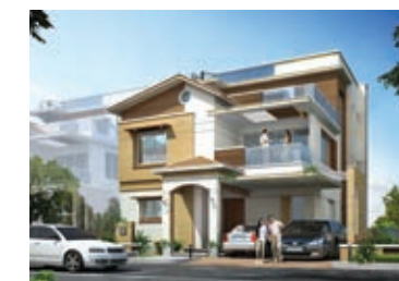
Green Province, Sarjapur