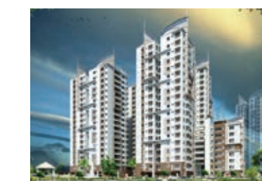
NCC Urban One, Narsingi