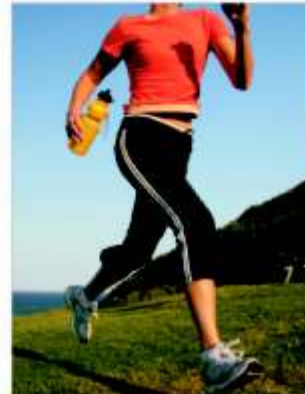
Jogging / Walking Track