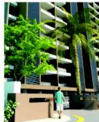
Attractive Entrance Gate