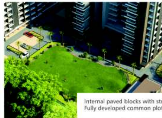
Internal paved blocks with street lights Fully developed common plot area