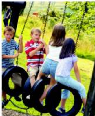
Children play area