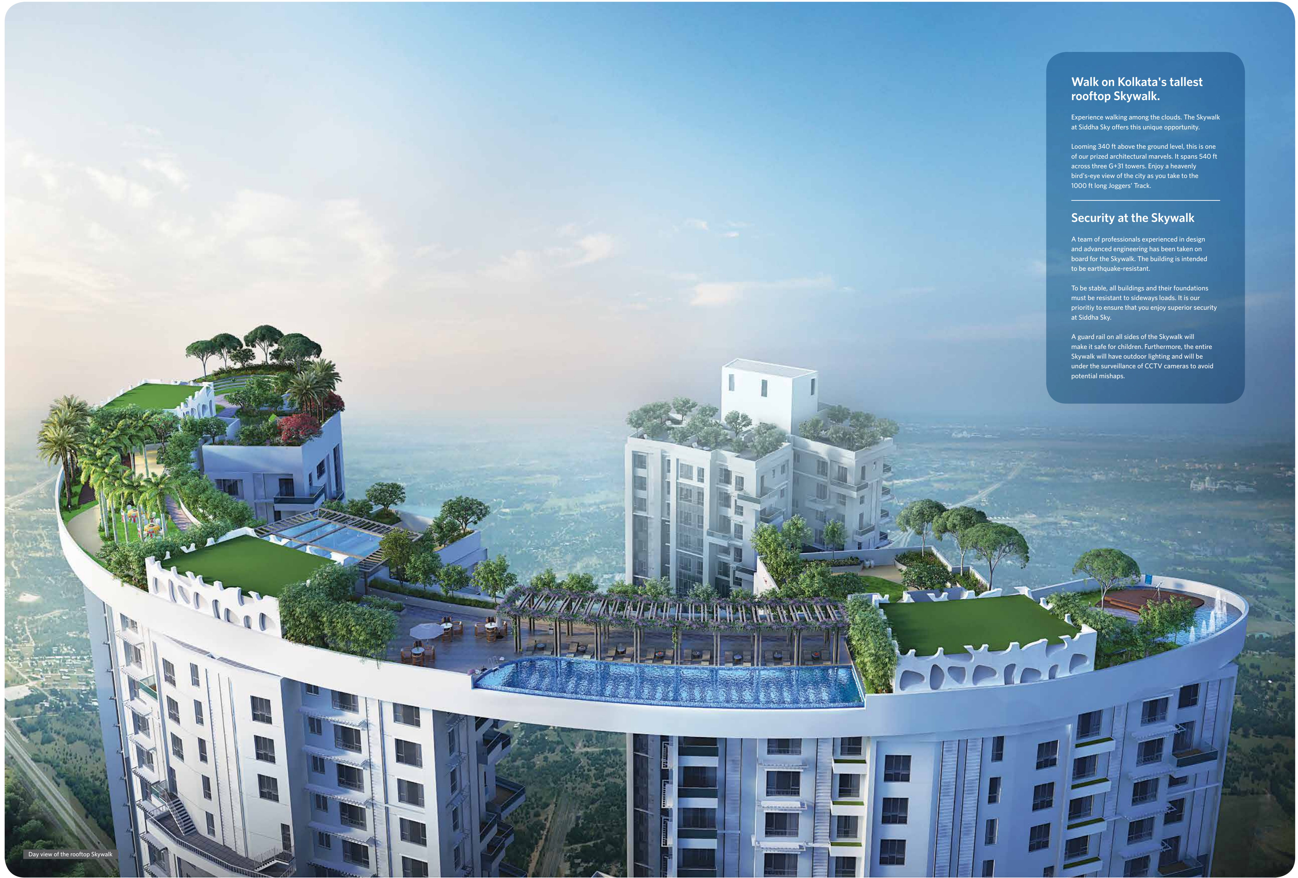
Day view of the rooftop Skywalk