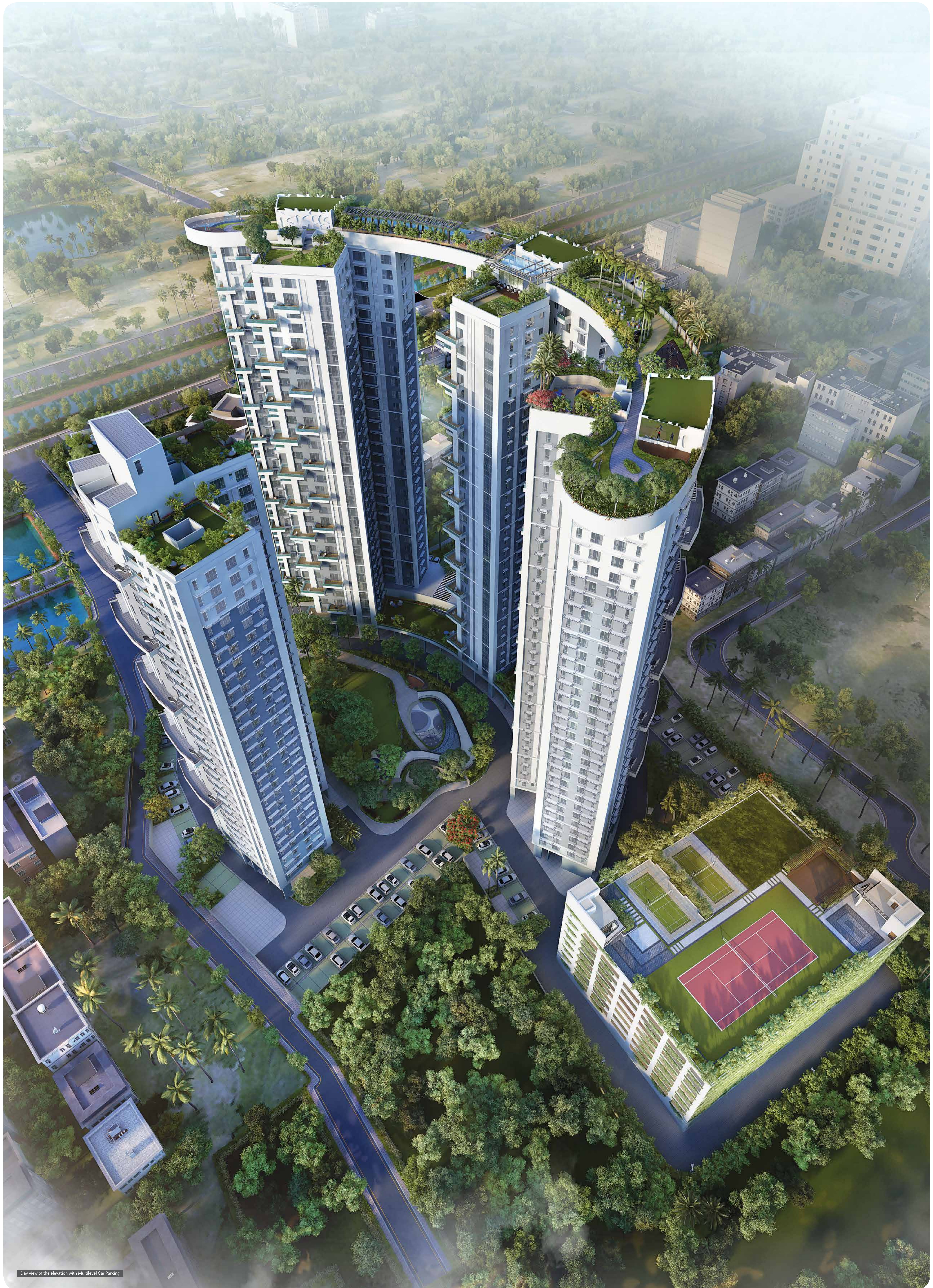
Day view of the elevation with Multilevel Car Parking