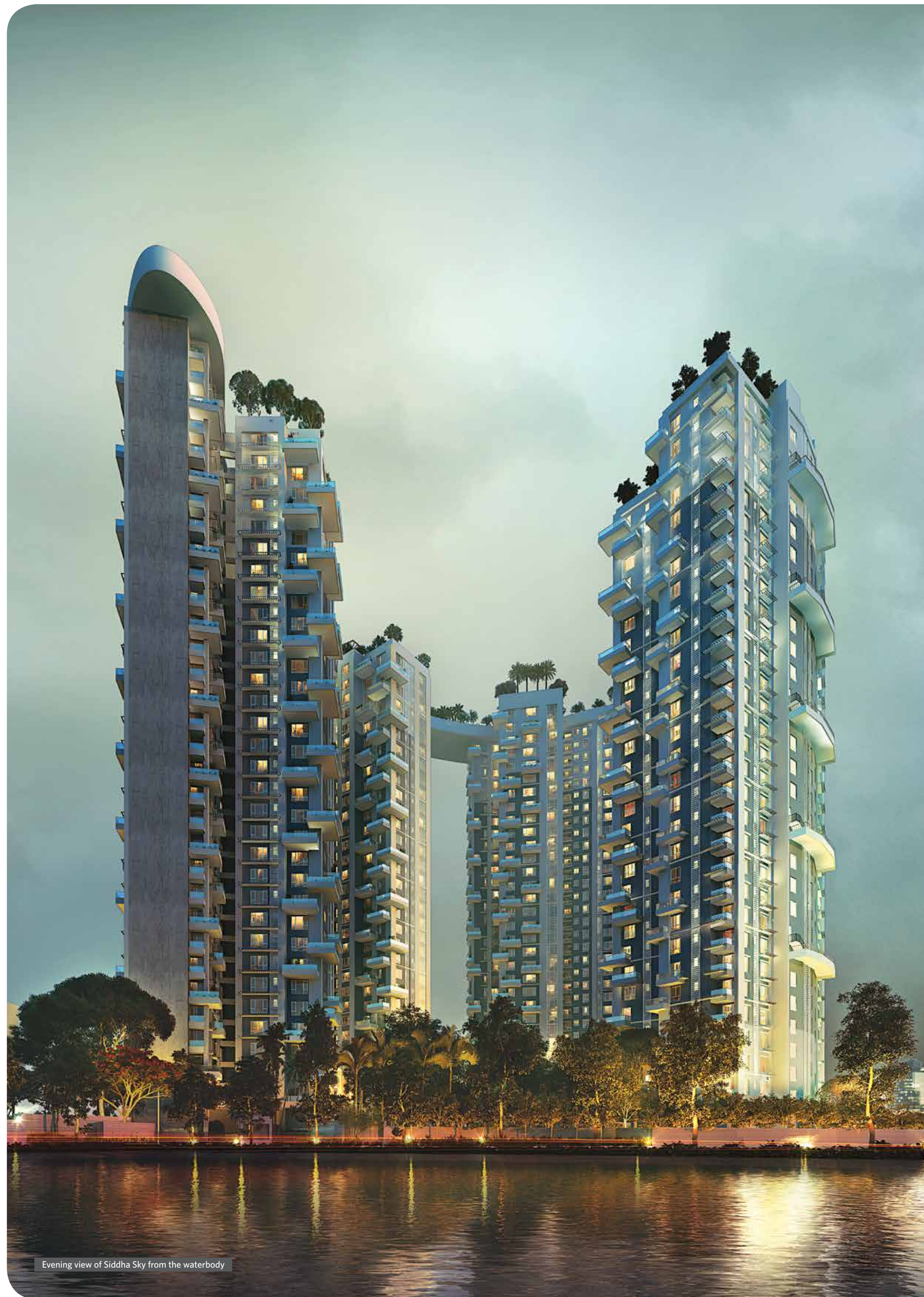
Evening view of Siddha Sky from the waterbody