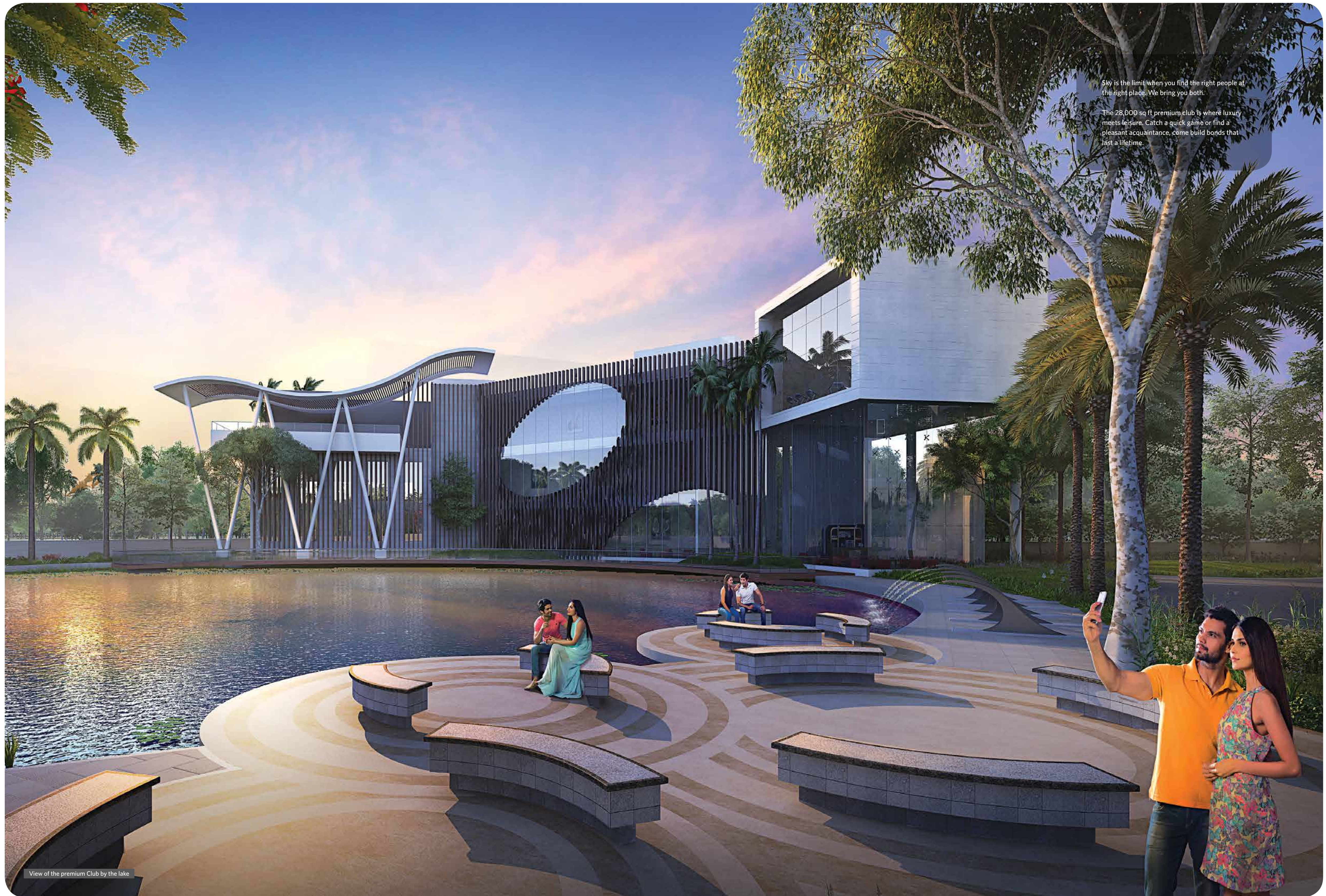
View of the premium Club by the lake

The 28,000 sq ft premium club is where luxury meets leisure. Catch a quick game or find a pleasant acquaintance, come build bonds that last a lifetime.