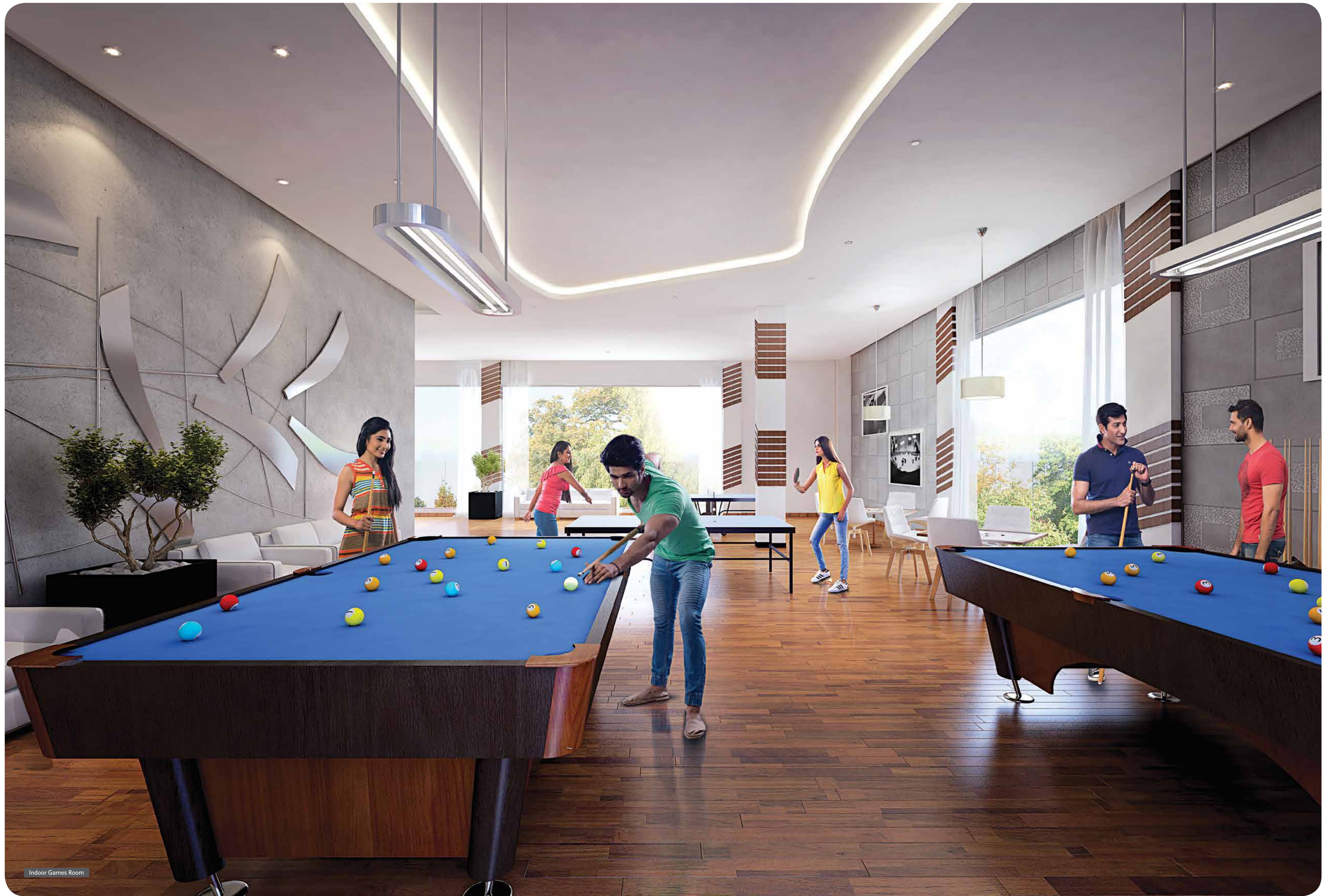
Indoor Games Room