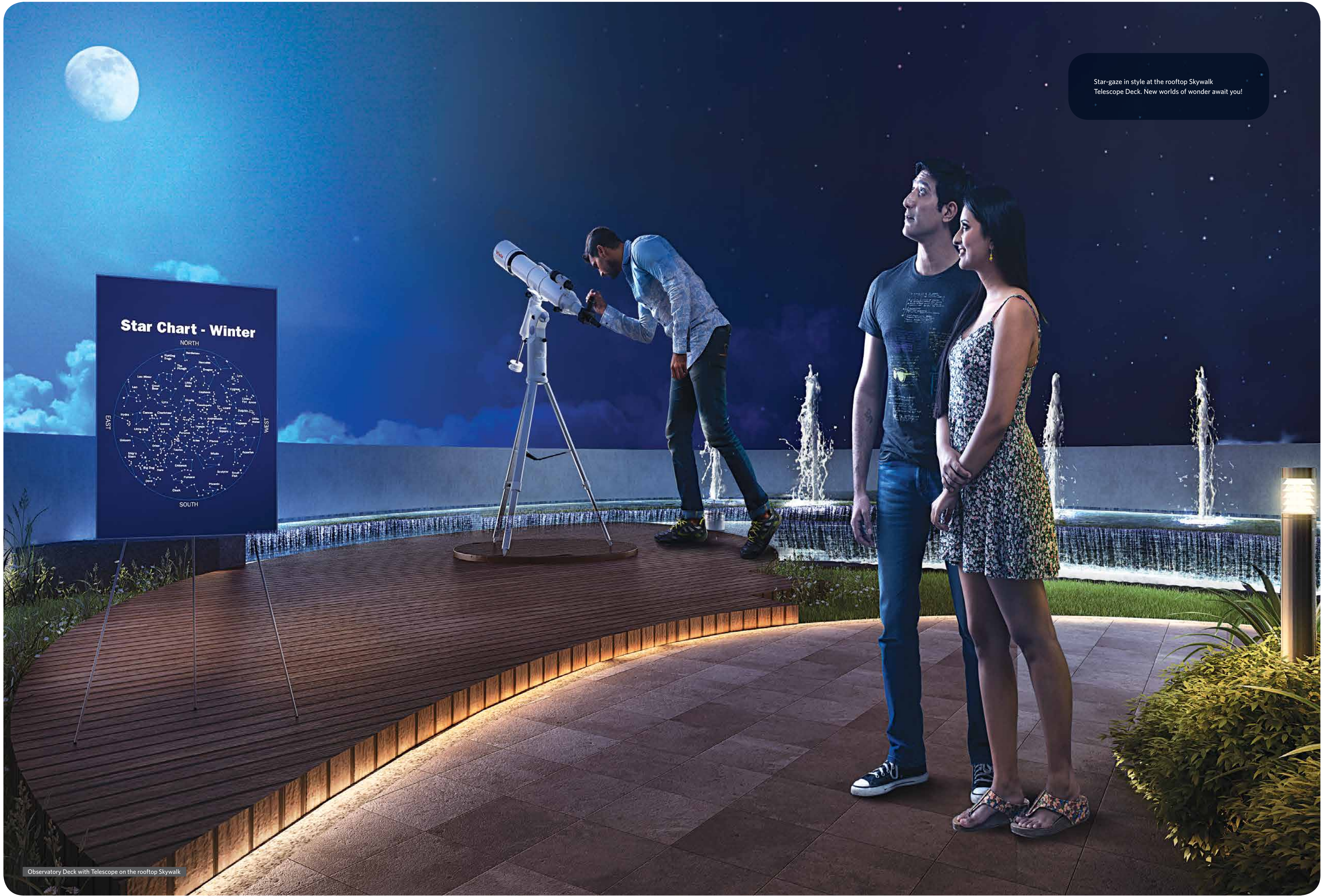
Observatory Deck with Telescope on the rooftop Skywalk

Star-gaze in style at the rooftop Skywalk Telescope Deck. New worlds of wonder await you!