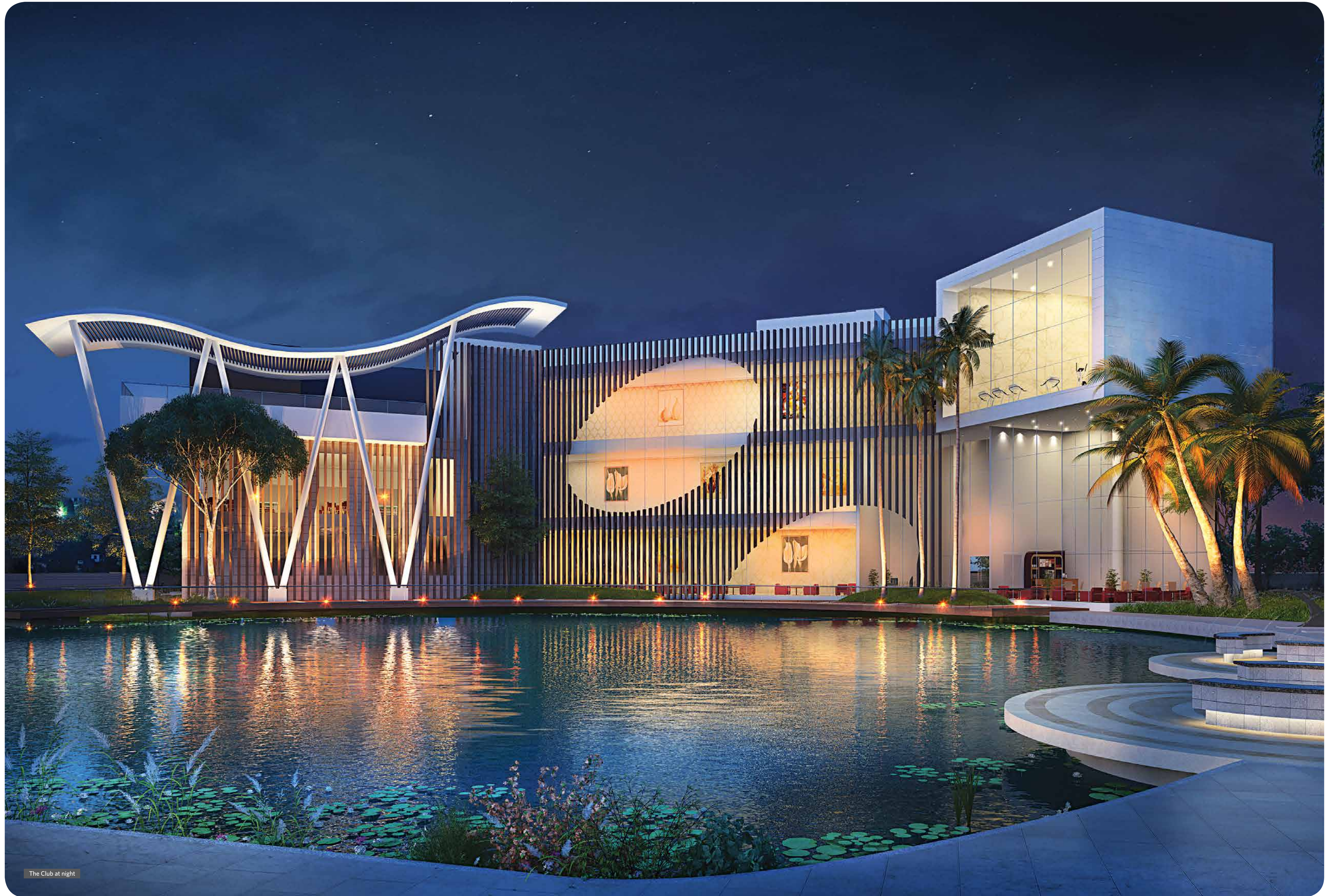
The Club at night