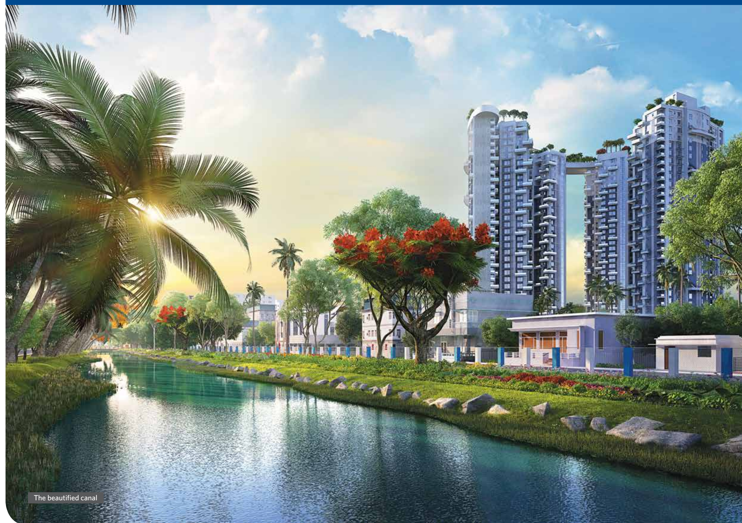
The beautified canal