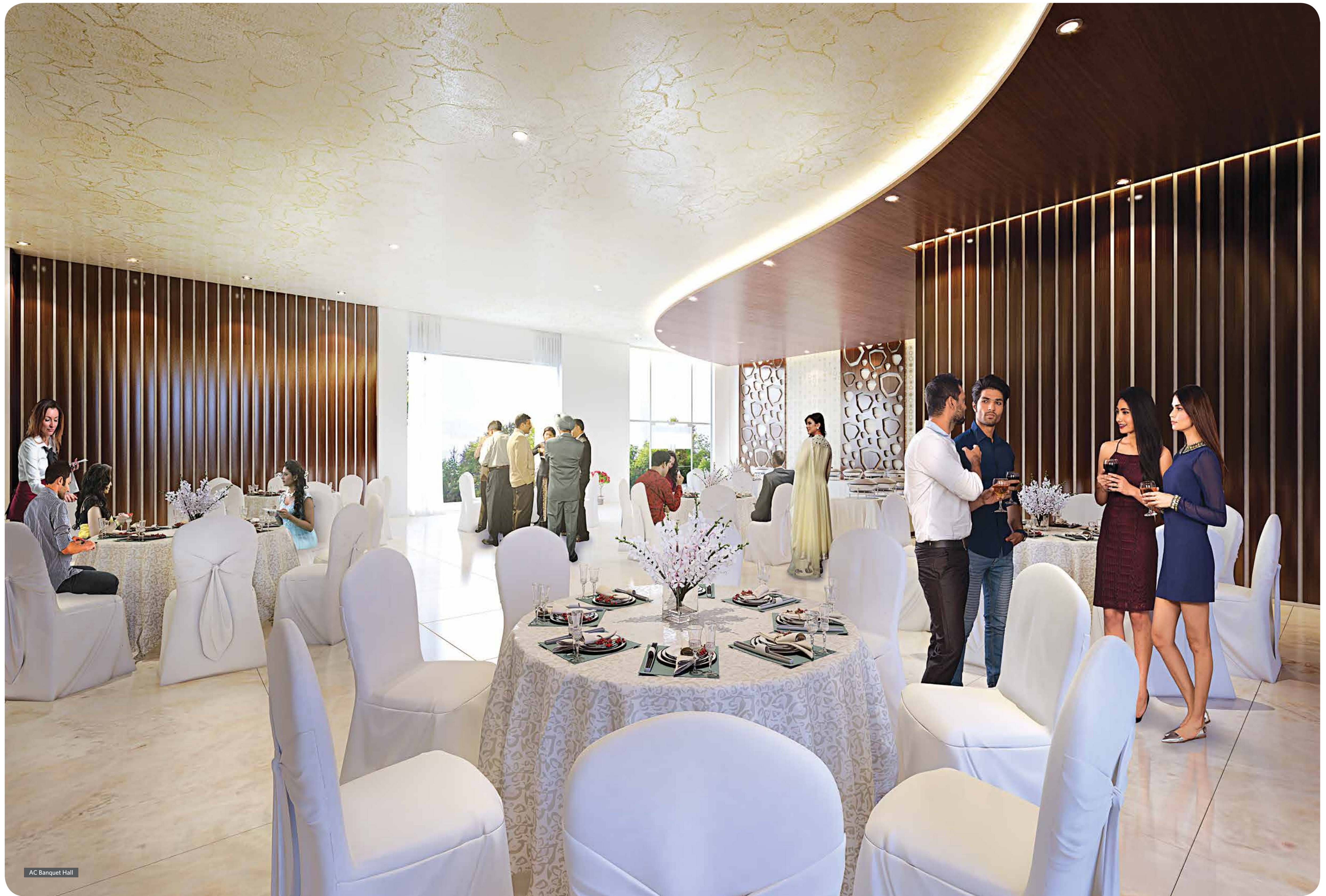
AC Banquet Hall