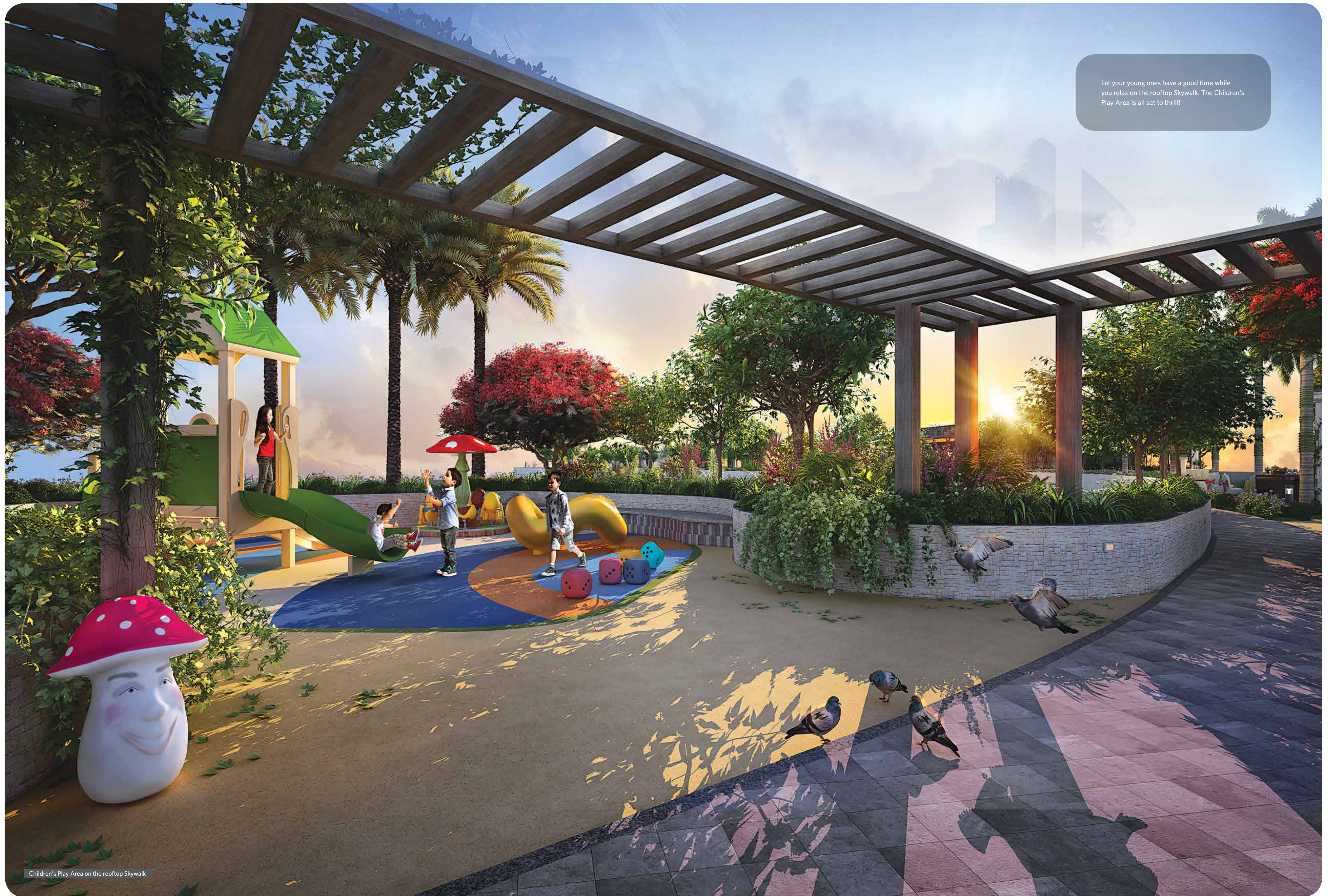
Children's Play Area on the rooftop Skywalk

Let your young ones have a good time while you relax on the rooftop Skywalk. The Children's Play Area is all set to thrill!