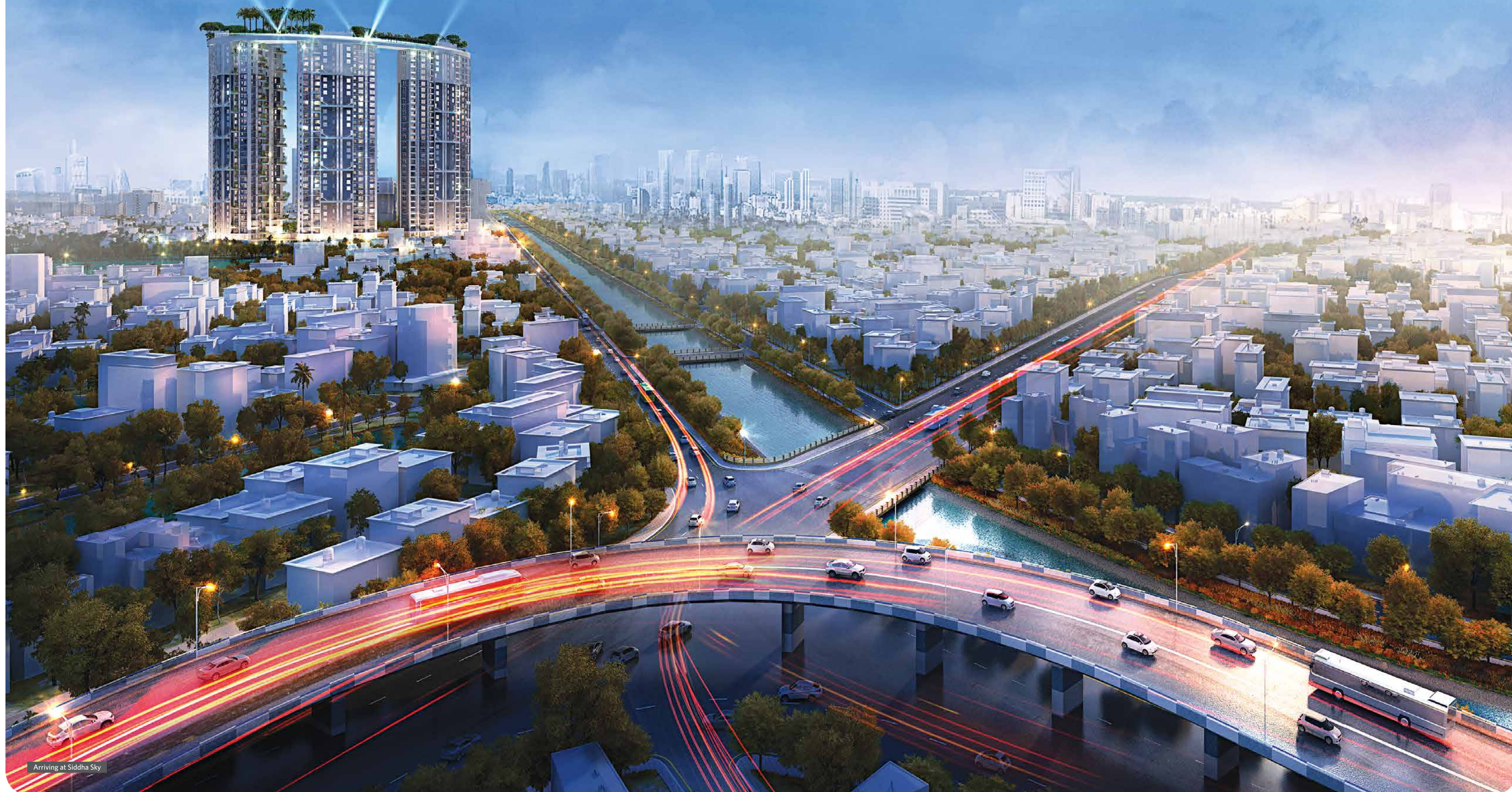
Arriving at Siddha Sky

At Canal South Road, Siddha Sky is mostly open to Nature. It is well connected to the tech hub at Sector V via the EM Bypass, and is easily accessible from New Town, Dalhousie, Park Street as well as Science City. Located well, it is only 1.5 km from Chingrighata crossing.