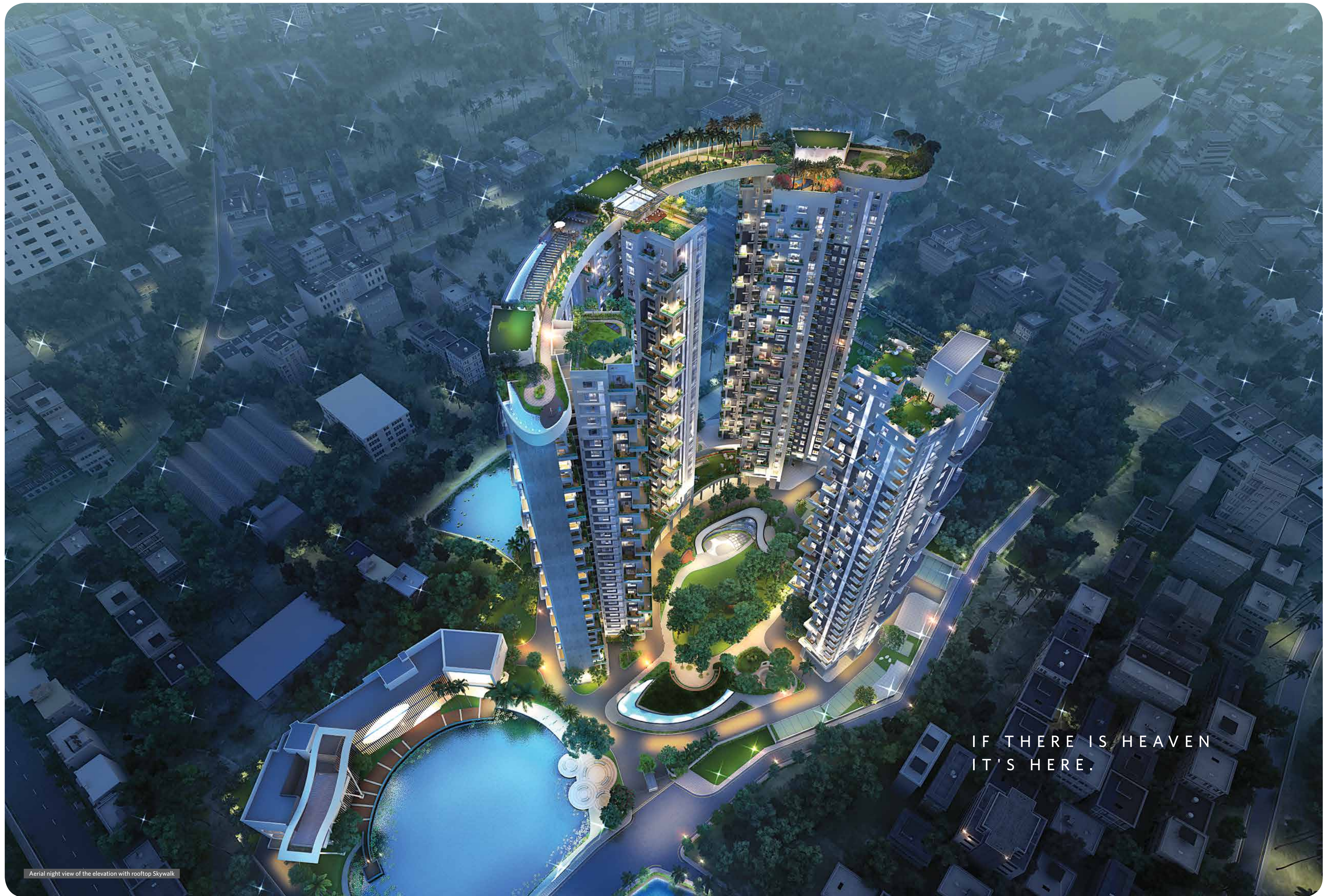
Aerial night view of the elevation with rooftop Skywalk