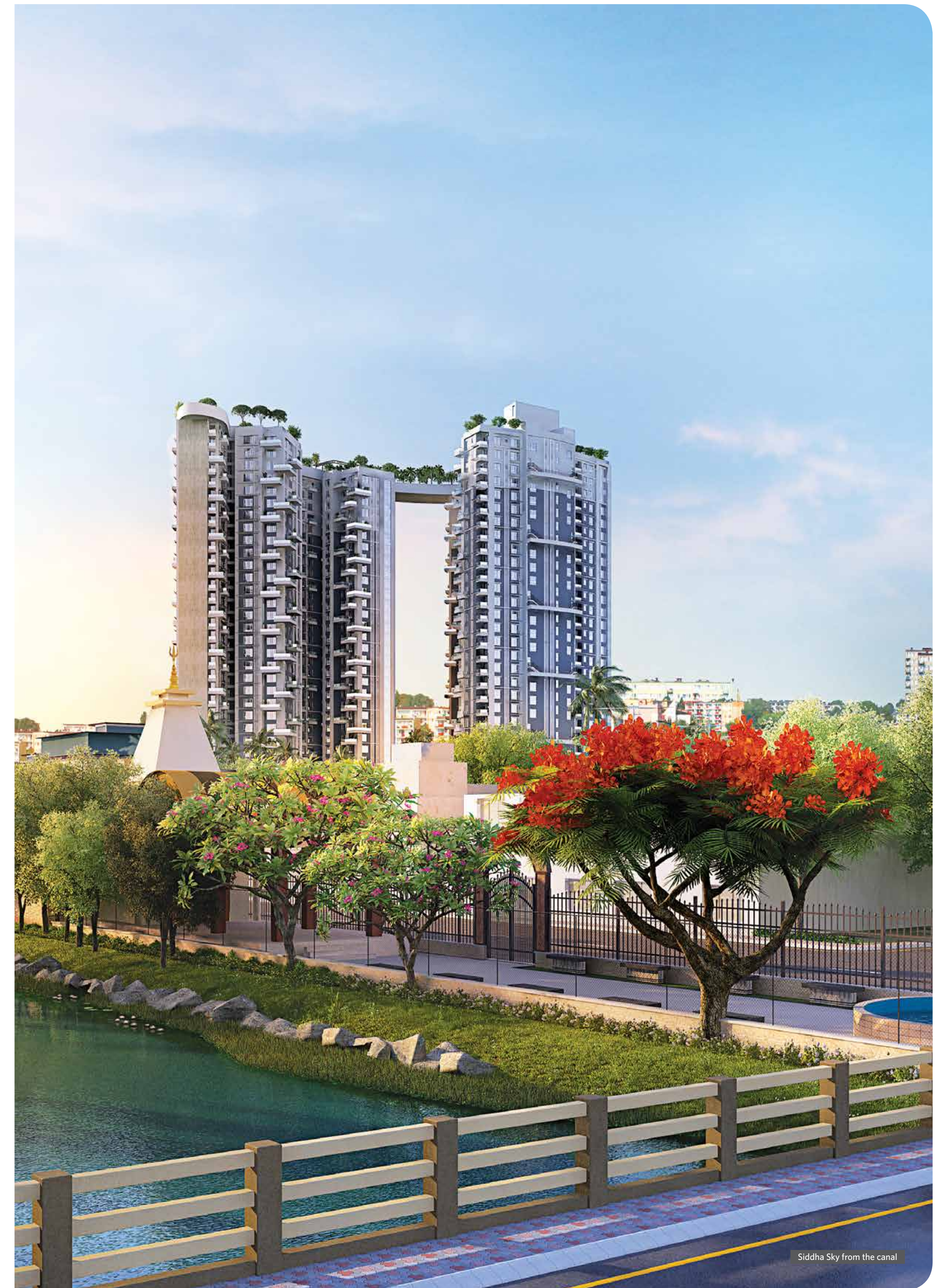
Siddha Sky from the canal