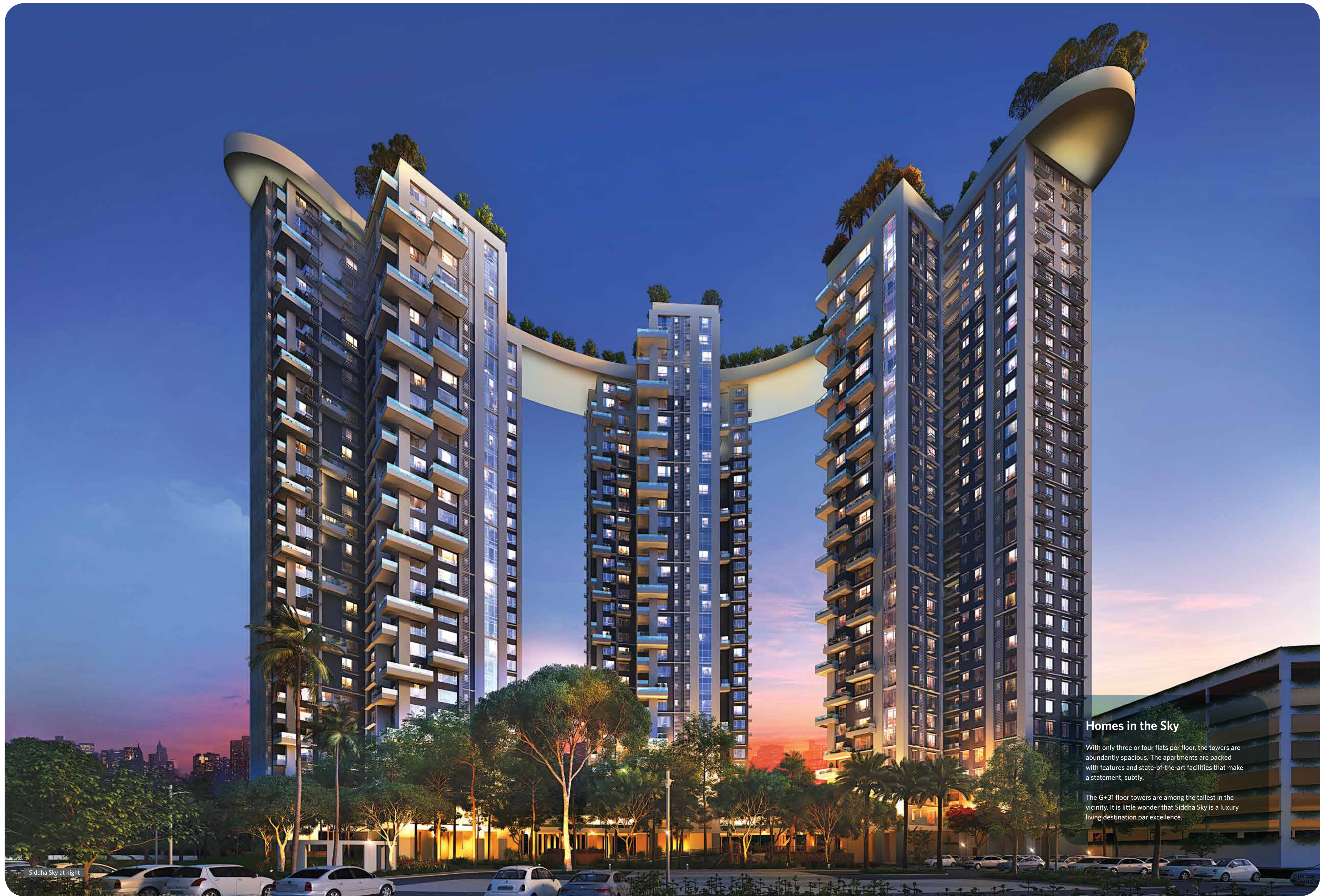
Siddha Sky at night