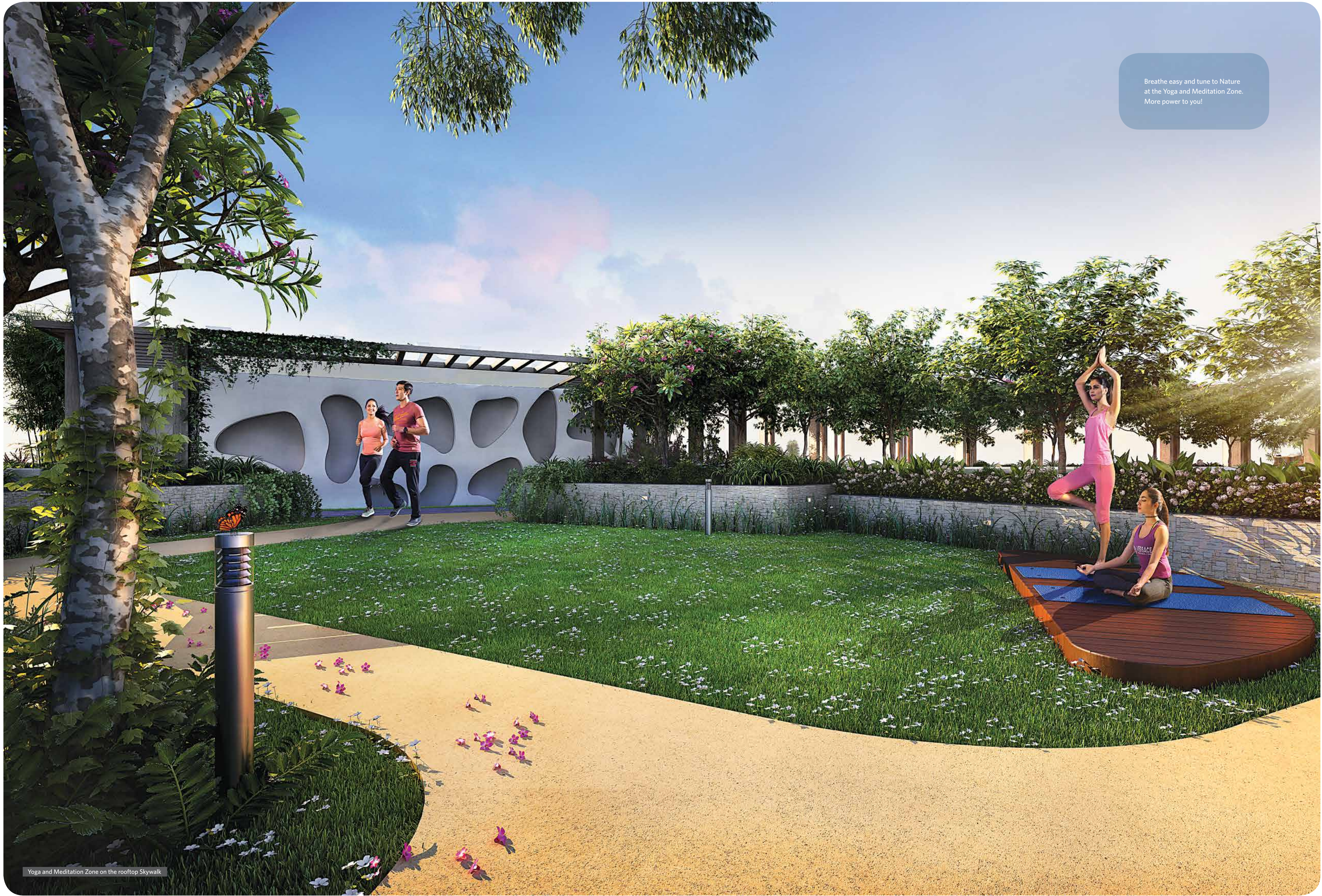
Yoga and Meditation Zone on the rooftop Skywalk

Breathe easy and tune to Nature at the Yoga and Meditation Zone. More power to you!