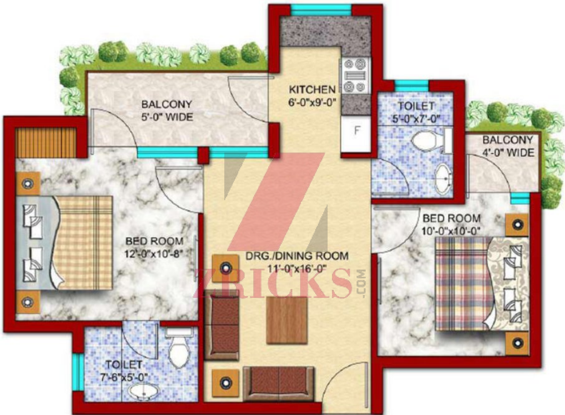
2 BHK Option1 875 SQFT Super Area