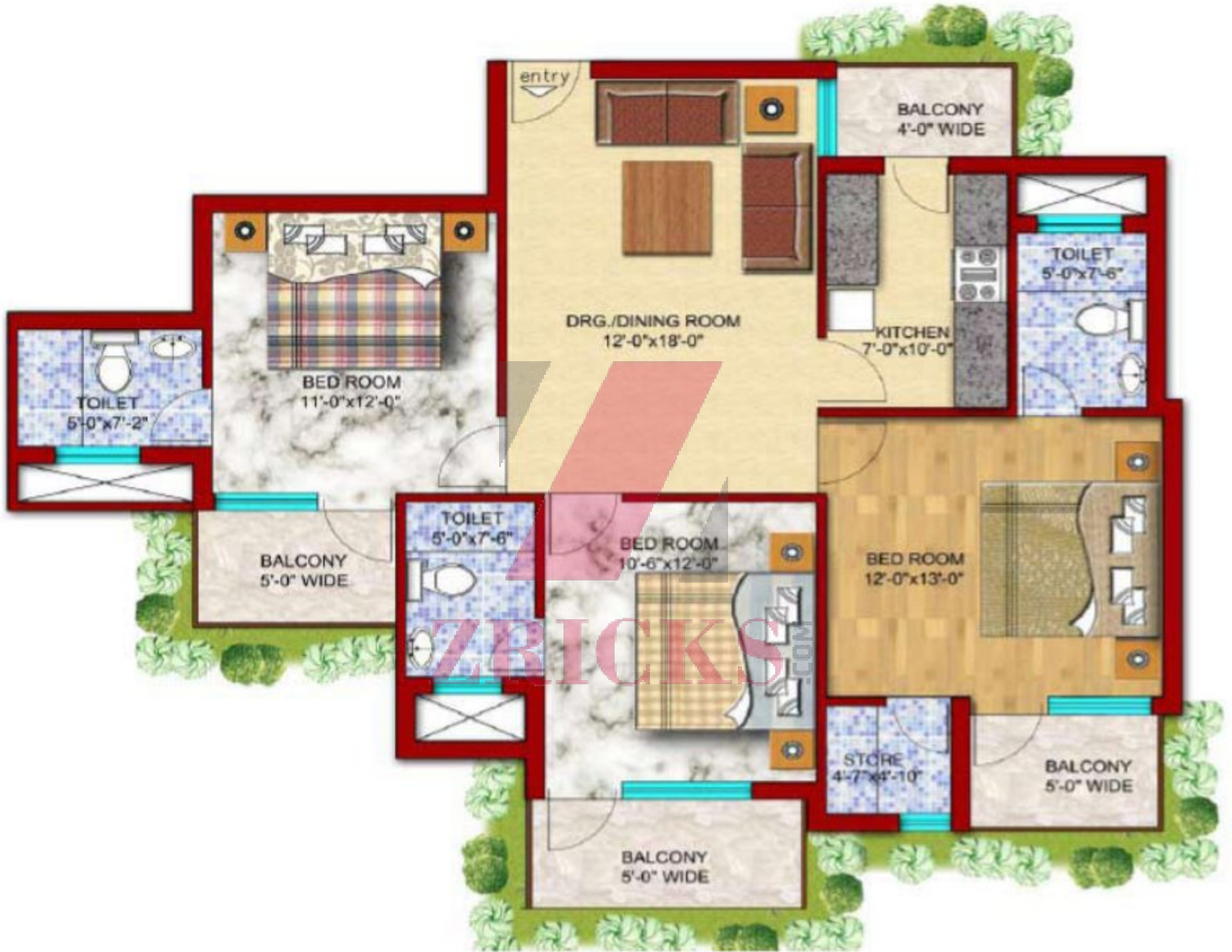
3 BHK 1350 SQFT Super Area