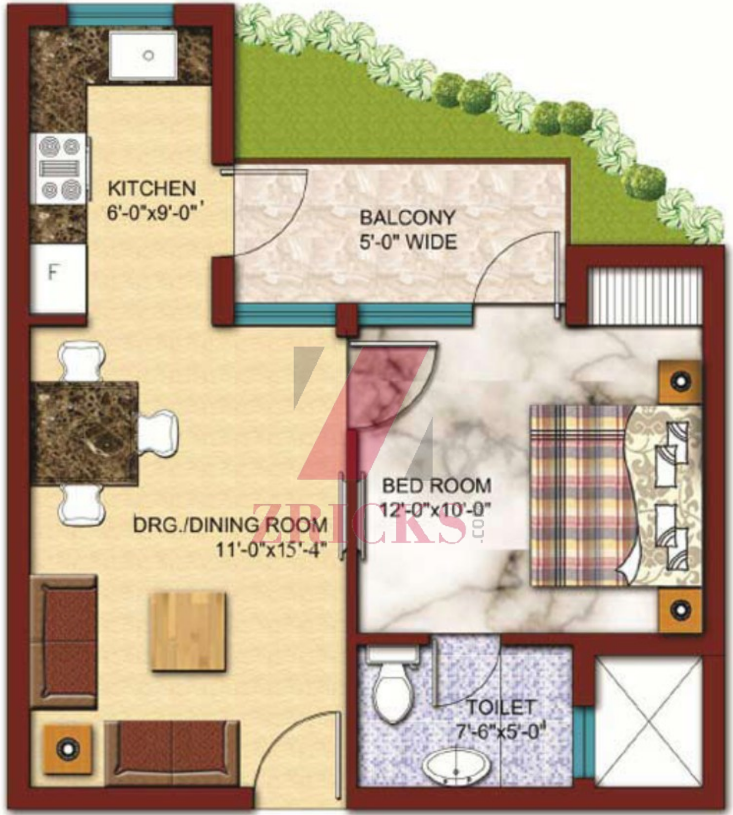
1 BHK 640 SQFT Super Area