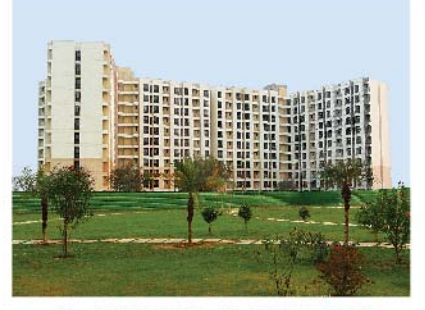
HZD-RESIDENCY, GR. NOIDA, WEST