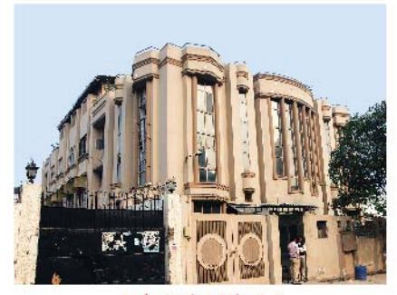
A-1/1, OKHLA PHASE-I