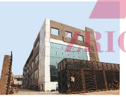
B-61, OKHLA PHASE-I