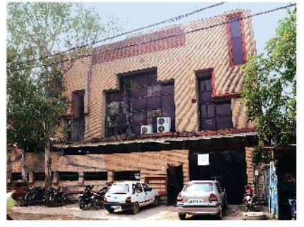
C-62/2, OKHLA PHASE-II