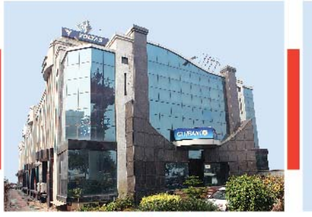
A-43, MATHURA ROAD