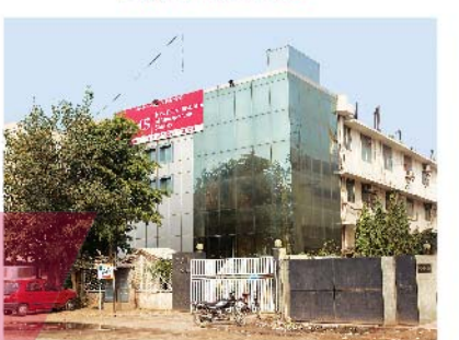
3-64, OKHLA PHASE-I