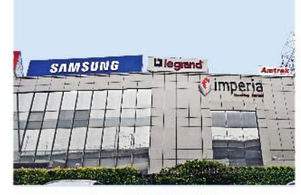
1-25, MATHURI ROD