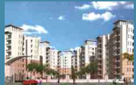
Krishna Apra Residency, Noida