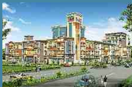
Krishna Apra D Mall Indirapuram, Ghaziabad