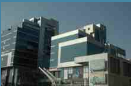
Krishna Apra Business Square, Pitampura