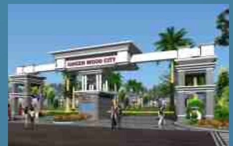
Krishna Artec Greenwood City, Sonapat