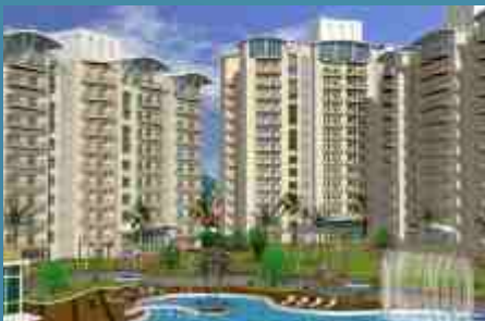
Krishna Apra Gardens Indirapuram, Ghaziabad