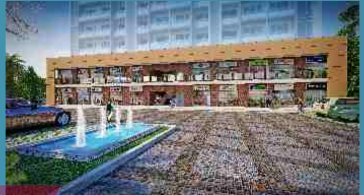
Arcity "Shop Mart" (G.Noida, West)