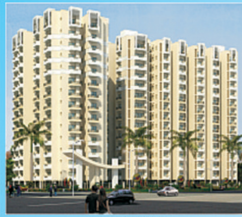
Himalaya Tanishq Raj Nagar Extn. Ghaziabad Possession Next Year