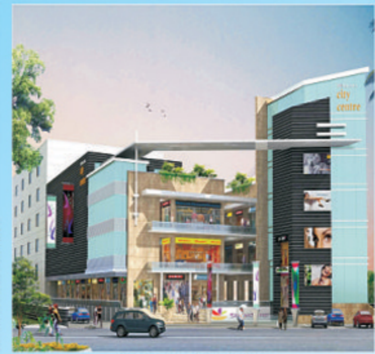
Himalaya City Centre Raj Nagar Extn. Ghaziabad Up Coming Project