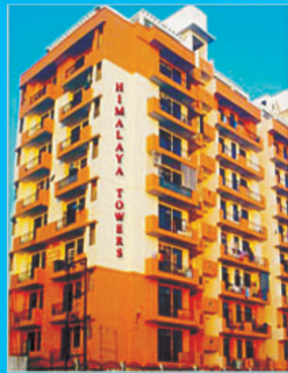
Himalaya Tower Indirapuram Near D.P.S. School Completed In March 2008