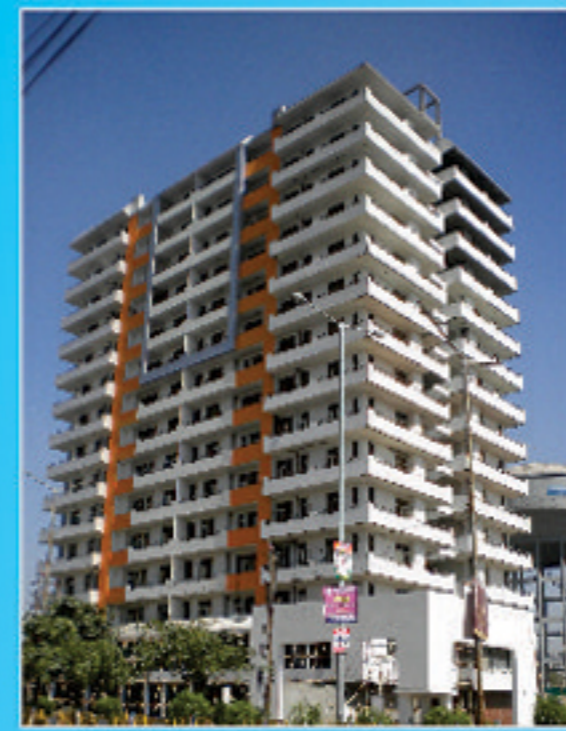
Himalaya Legend Indirapuram Near Indirapuram School Completed In 2011