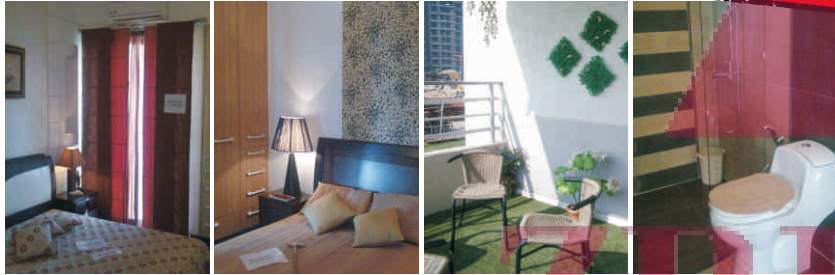
Actual Sample Flat Photo