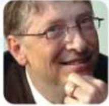
BILL GATES Microsoft

"Three years ago, during my visit to India, the country was emerging as an IT superpower. Today, the country is handling the most sophisticated projects in the world... I am impressed with the talent we have in our India Development Centre and the quality of software being developed."