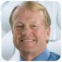
JOHN CHAMBERS CISCO Systems

"Three years ago, during my visit to India, the country was emerging as an IT superpower. Today, the country is handling the most sophisticated projects in the world... I am impressed with the talent we have in our India Development Centre and the quality of software being developed."