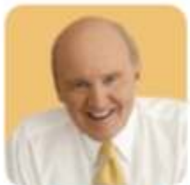
JACK WELCH General Electric

"India can become a major part of Dell's operations and a major source of the human capital that Dell takes on as a company... and we are looking for further opportunities to take advantage of skilled labour."