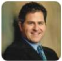
MICHAEL DELL Dell Computers

"We are expanding our presence in India to take advantage of the ample research and development talent available...our Global Development Centre is a critical component of our future success."