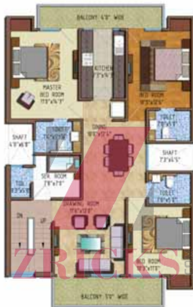
FIRST & SECOND FLOOR PLAN