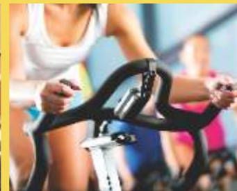
Health and Fitness