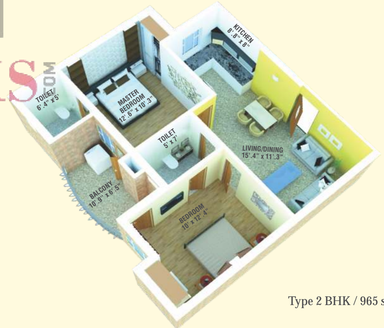
Type 2 BHK / 965 sq.ft.