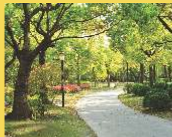
Greens and Gardens