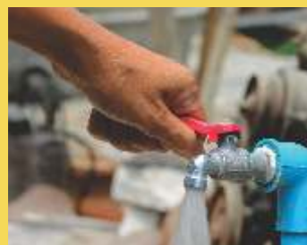
24x7 Water Supply