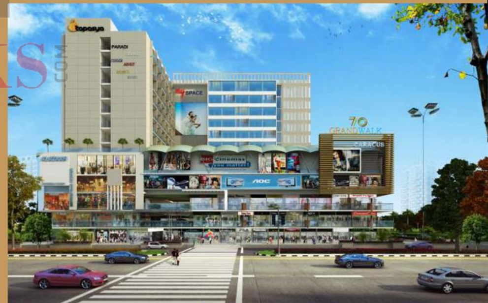
STREET VIEW OF 70 GRANDWALK FACING 60 METRE ROAD

70 GrandWalk will provide superb entertainment, epicurean adventure, sensational retail opportunities and living spaces on an unprecedented scale..