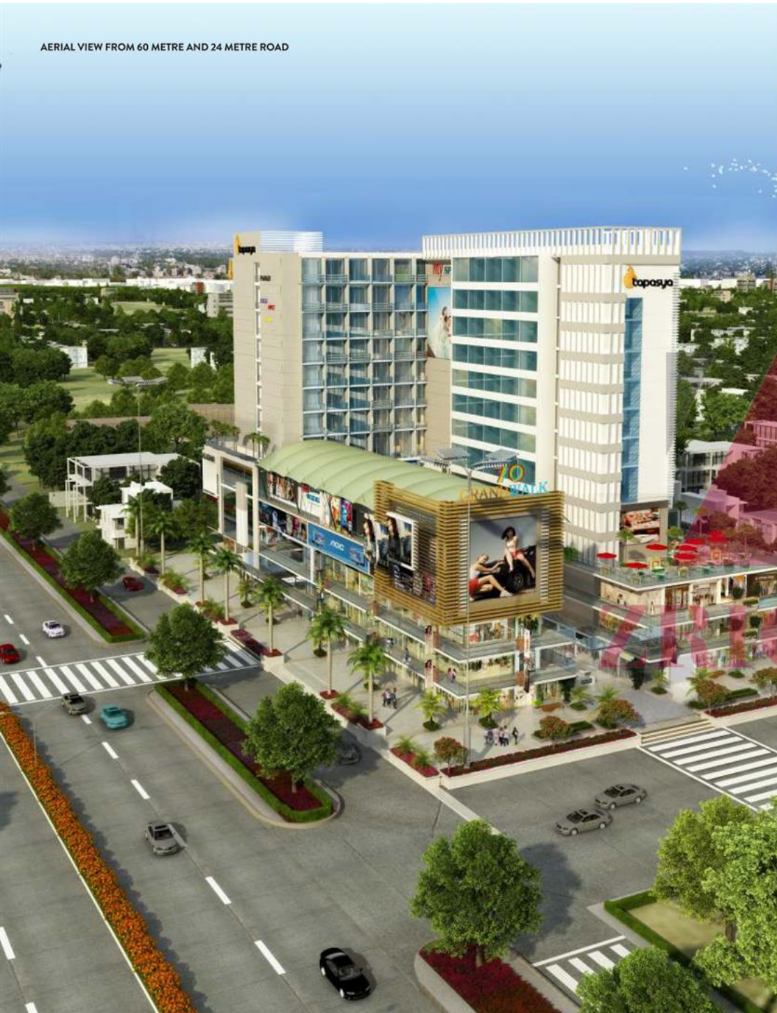
AERIAL VIEW FROM 60 METRE AND 24 METRE ROAD