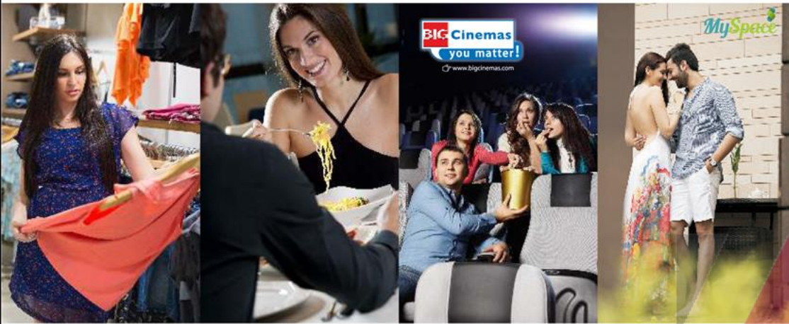
RETAIL WITH SIGNATURE ANCHOR STORE