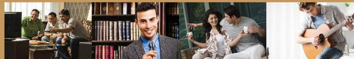
PRIVATE TIME WITH FRIEND