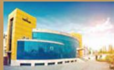
Ginni Filaments Ltd.

Mixed land use Development (commercial, Hotel, Multiplex Mega project) Pari Chowk - Greater Noida