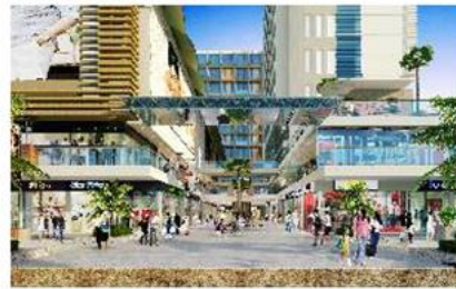
VIEW OF CENTRAL ATRIUM

WALK AT YOUR OWN PACE AMIDST A VIBRANT VEHICULAR FREE ENVIRONMENT