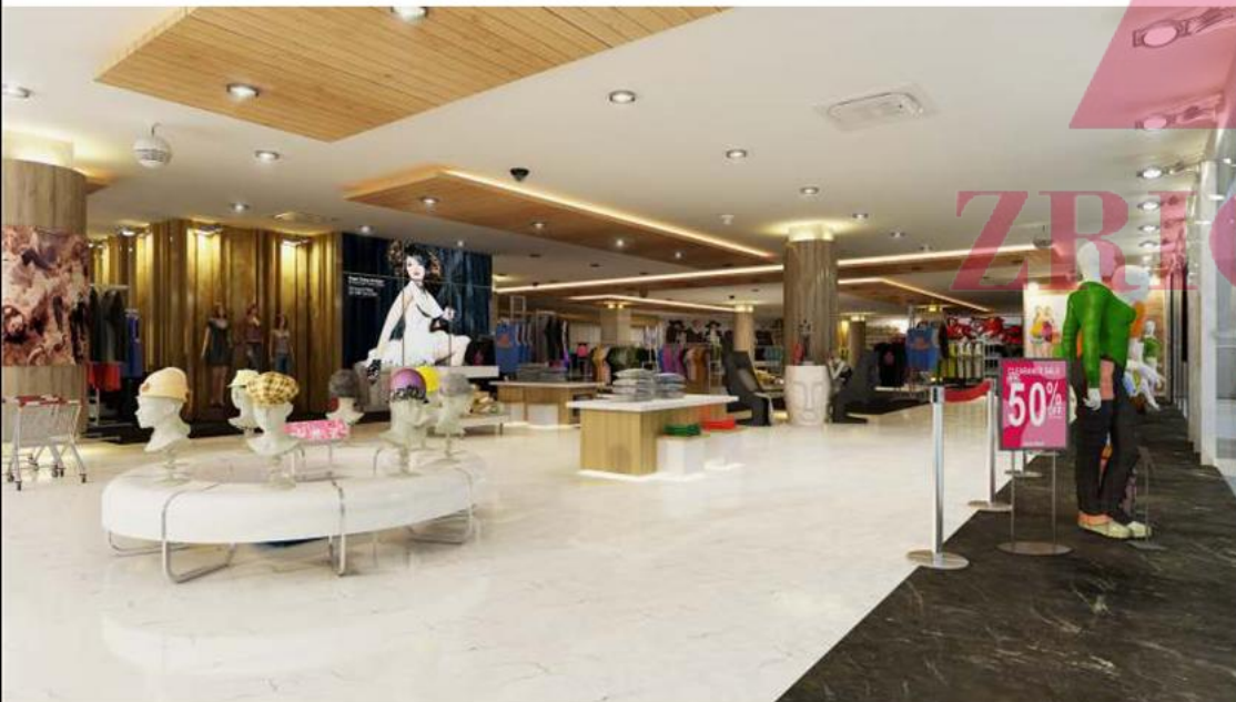
ANCHOR STORE AT 70 GRANDWALK

70 GrandWalk brings you an environment that's both relaxed and rejuvenating.