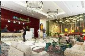
RECEPTION AND LOUNGE