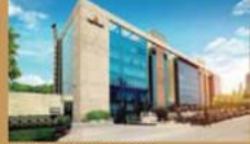
TAPASYA CORP HEIGHTS