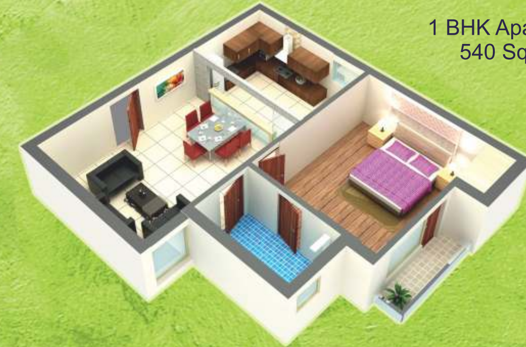
1 BHK Apartments 540 Sq. Ft.*