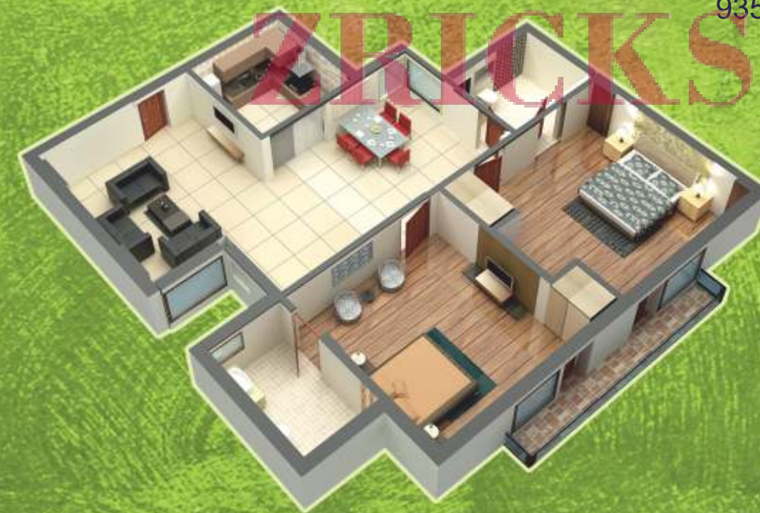
2 BHK Apartments 935 Sq. Ft.*