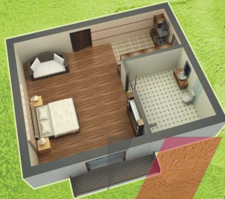
Studio Apartments Fully Furnished 470 Sq. Ft.*