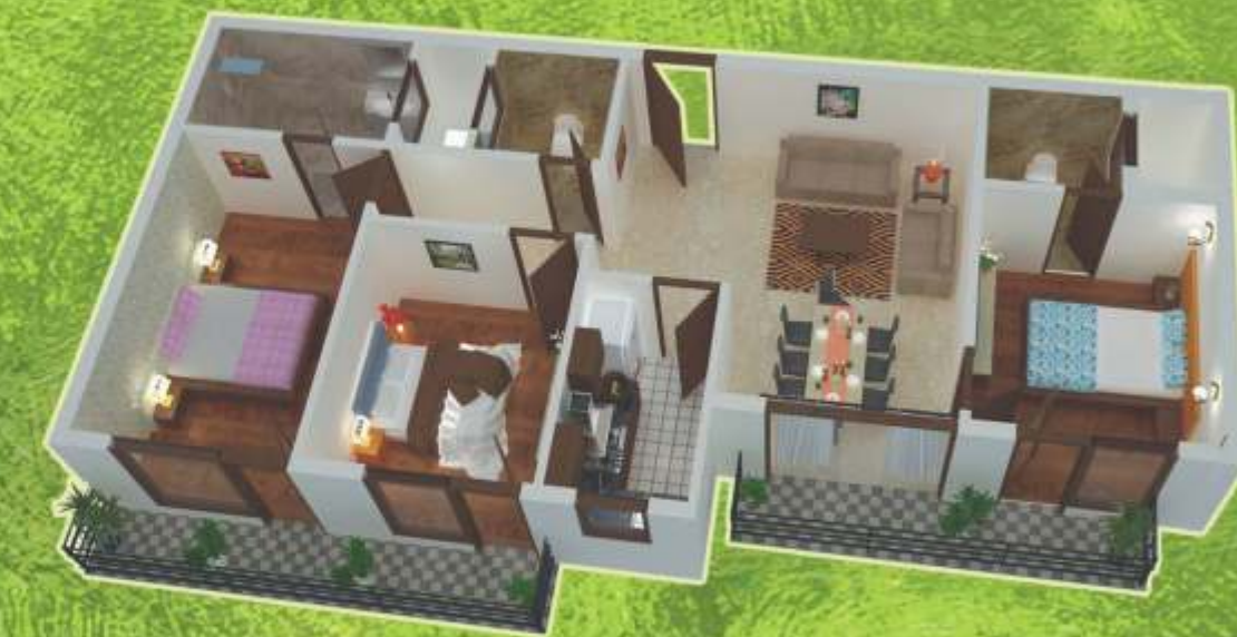
3 BHK Apartments 1290 Sq. Ft.*

Note: "All building plans, elevations, facade & layout plans shown on the brochure are conceptual; subject to change and modification as decided by the company, architects or any other competent authority."