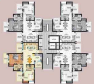
2BR Unit (1250 sq. ft)