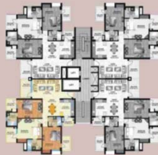
3BR Unit (1600 sq. ft)