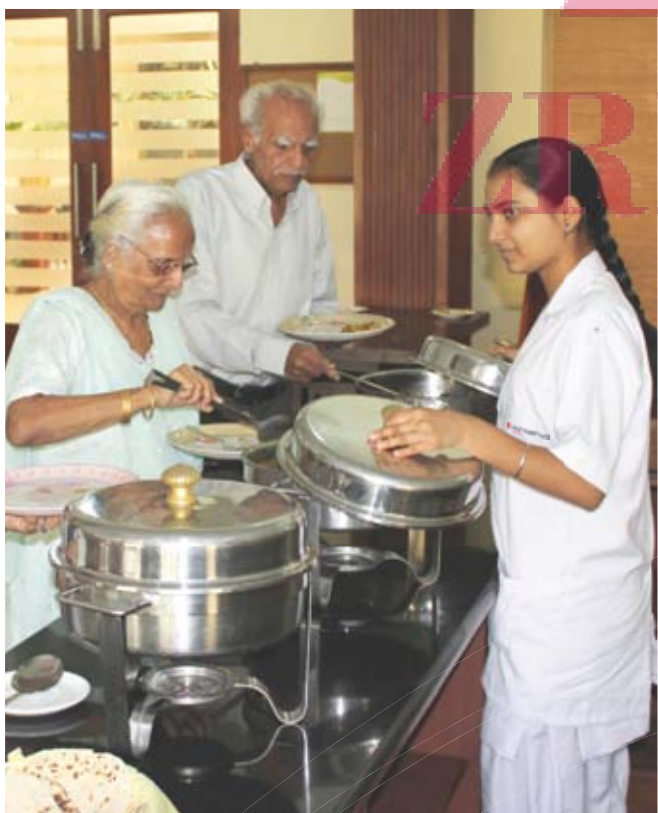
*at extra cost

will make it possible for you to get the best out of your life. Utsav Care Homes will make you feel your retirement is a bonus-an opportunity for a renaissance; a time to make great choices for yourself.