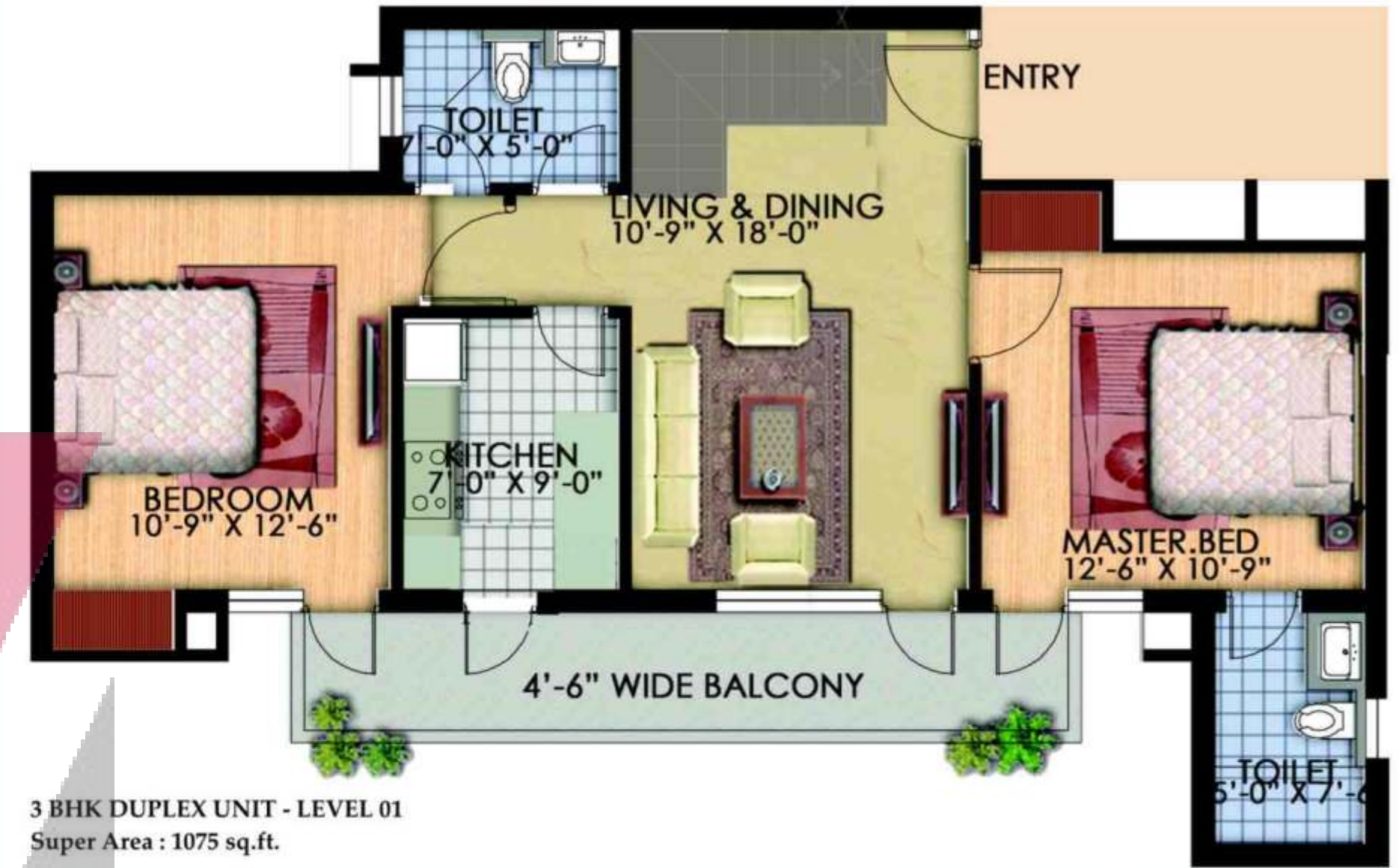
3 BHK DUPLEX UNIT - LEVEL 01 Super Area : 1075 sq.ft.