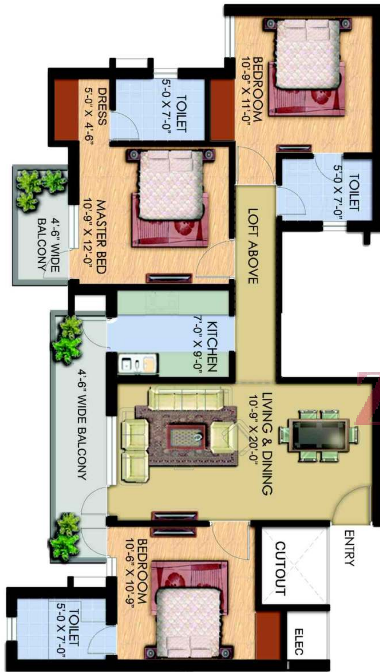
3 BHK UNIT LAYOUT Super Area : 1390 sq.ft.