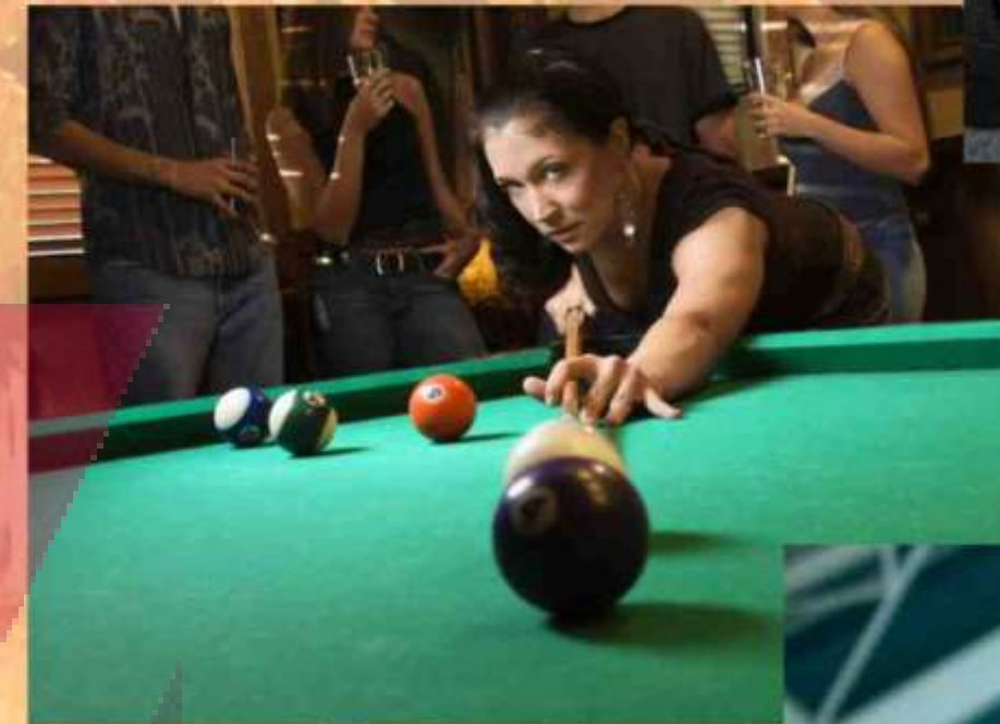
CAFETERIA RESTAURANT / BAR