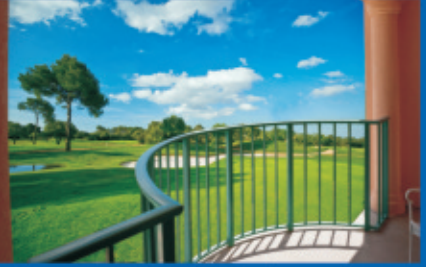
Bedrooms with balcony with grand view