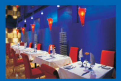
Multi-cuisine restaurant cum bo