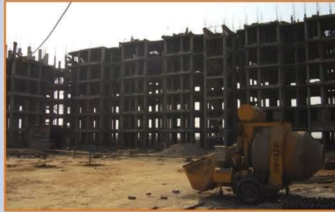
Actual Site Photograph of Avalon Residency, Ph. I, Bhiwadi