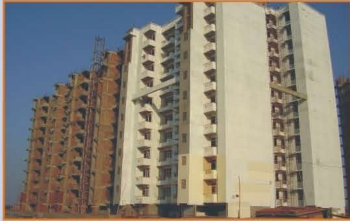
Actual Site Photograph of Avalon Gardens, Bhiwadi