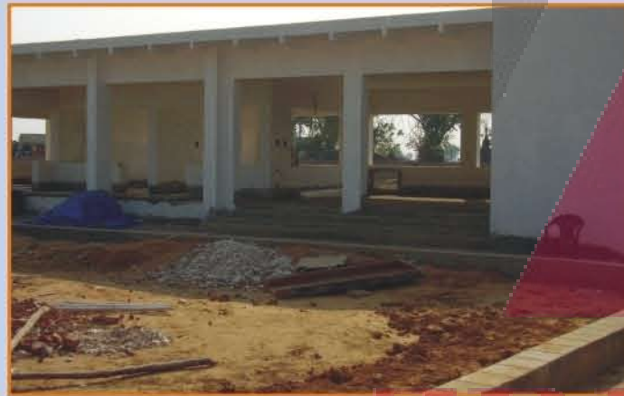
Actual Site Photograph of Avalon Homes, Bhiwadi

avalon Residency BHIWADI affordable housing