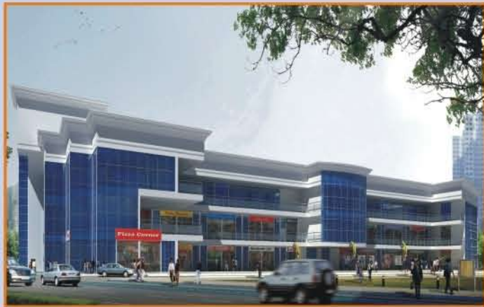
Perspective View of Avalon Plaza, Bhiwadi