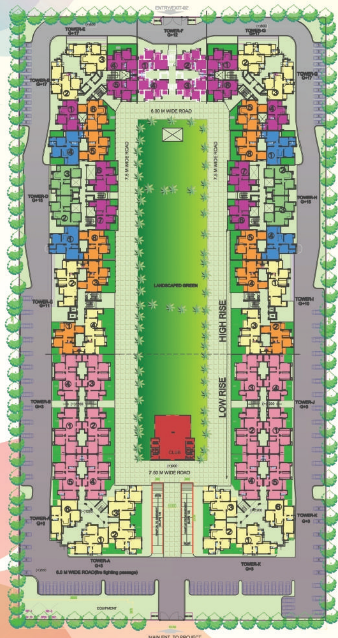
site LAYOUT PLAN TYPICAL Floor