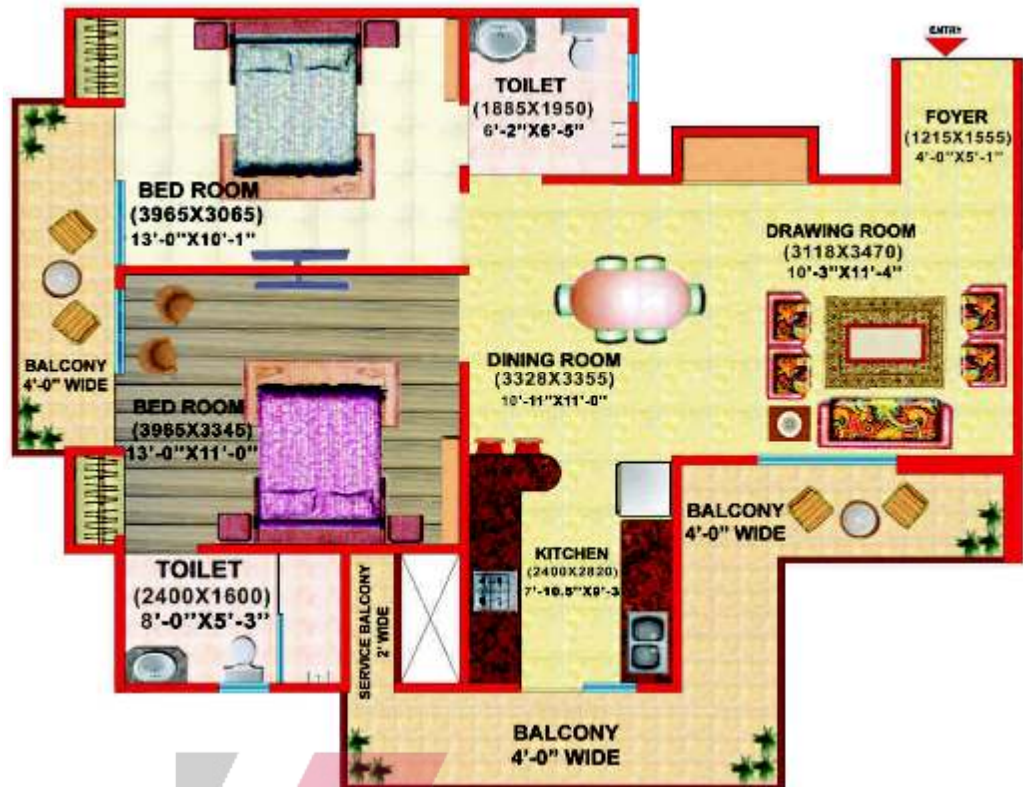
TYPICAL FLOOR PLAN Saleable Area : 1246.00 sq.ft. (115.75 sq.mt.)