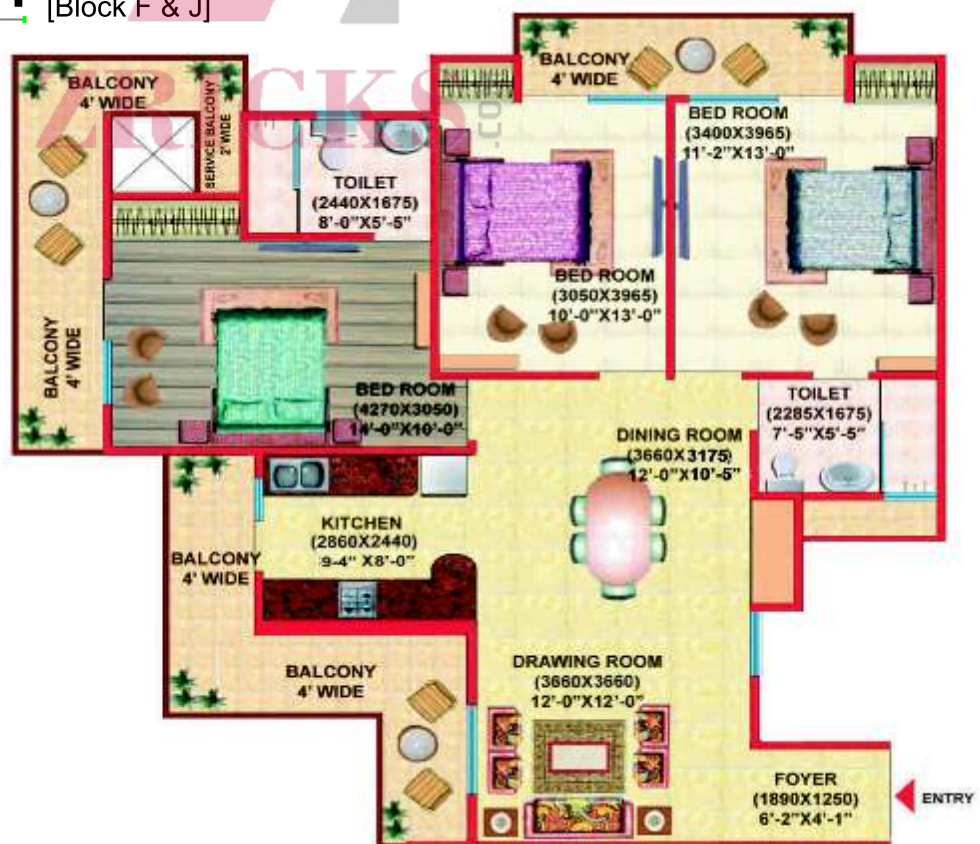
TYPICAL FLOOR PLAN Saleable Area : 1625.00 sq.ft. (150.96 sq.mt.)

Disclaimer : The areas and plans shown here are subject to change 1 sq.ft.=0.09290304 sq.mt. 10.764 sq.ft.=1 sq.mt. = 1.196 sq.yd. and 3.28 ft.=1 mt.