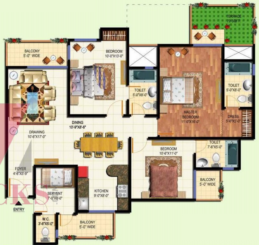
3 BED 4 TOILET SERVENT WITH TERRACE AREA= 1700 SQ.FT.

PROPOSED GROUP HOUSING FOR "AMRAPALI CENTURIAN PARK" AT NOIDA EXTN. Architects: Deepak Mehta and Associates, Plot No. 16, Abhishek Plaza L.S.C. Mayur Vihar ph II Delhi-91