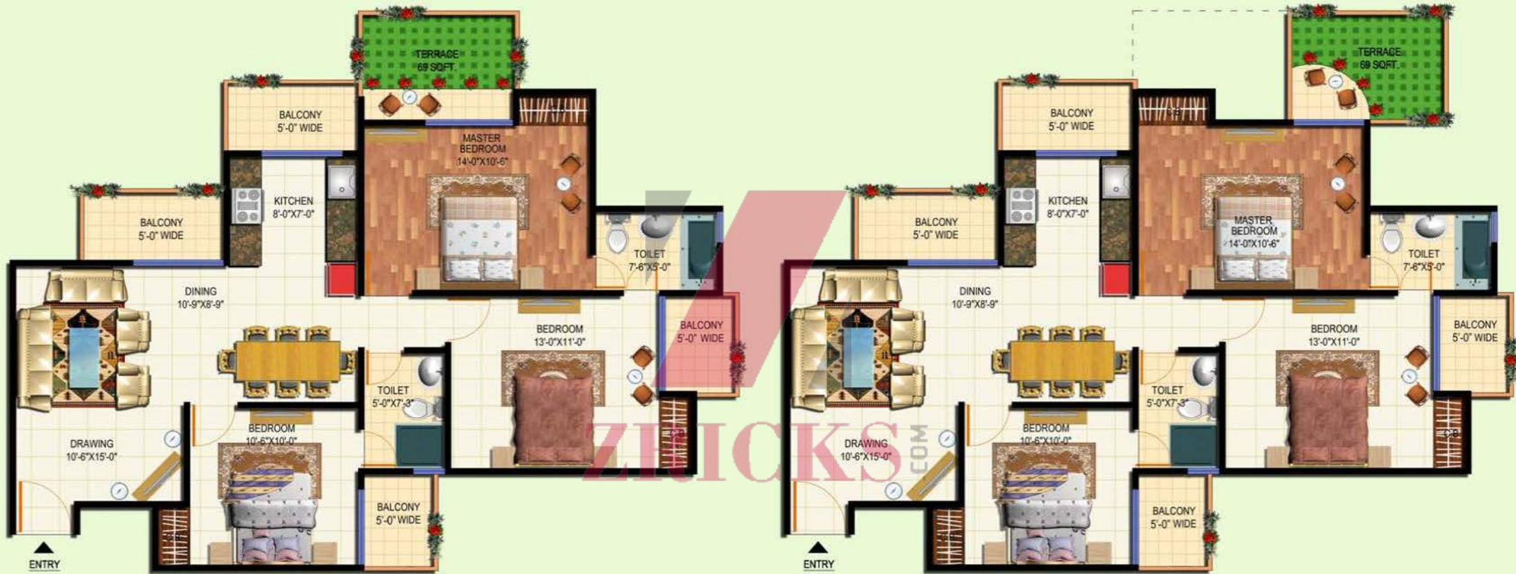
3 BED 2 TOILET WITH TERRACE