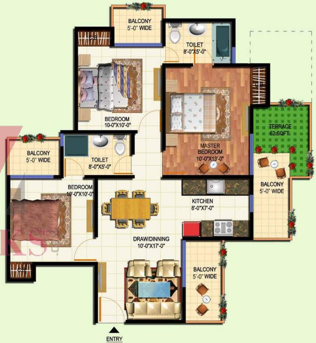
3 BED 2 TOILET (SMALL) WITH TERRACE