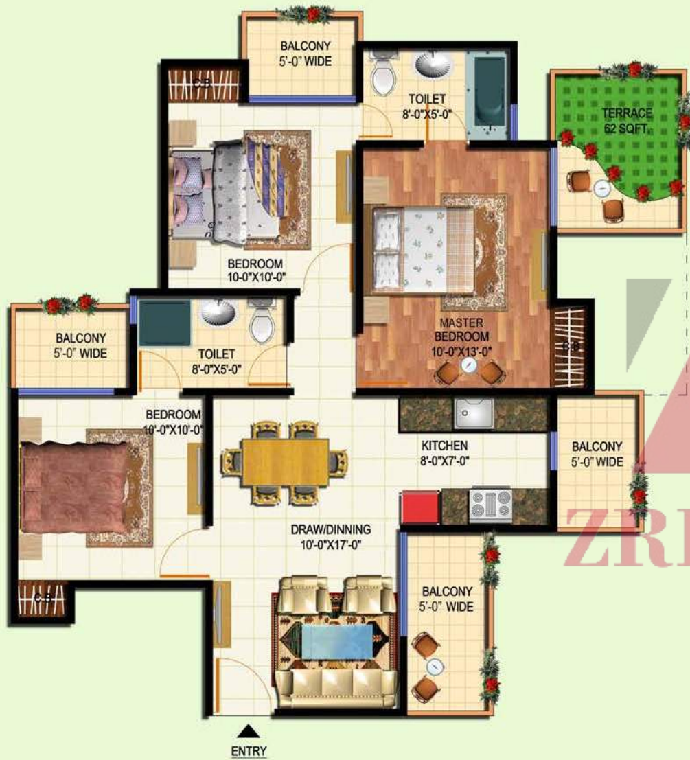
3 BED 2 TOILET (SMALL) WITH TERRACE