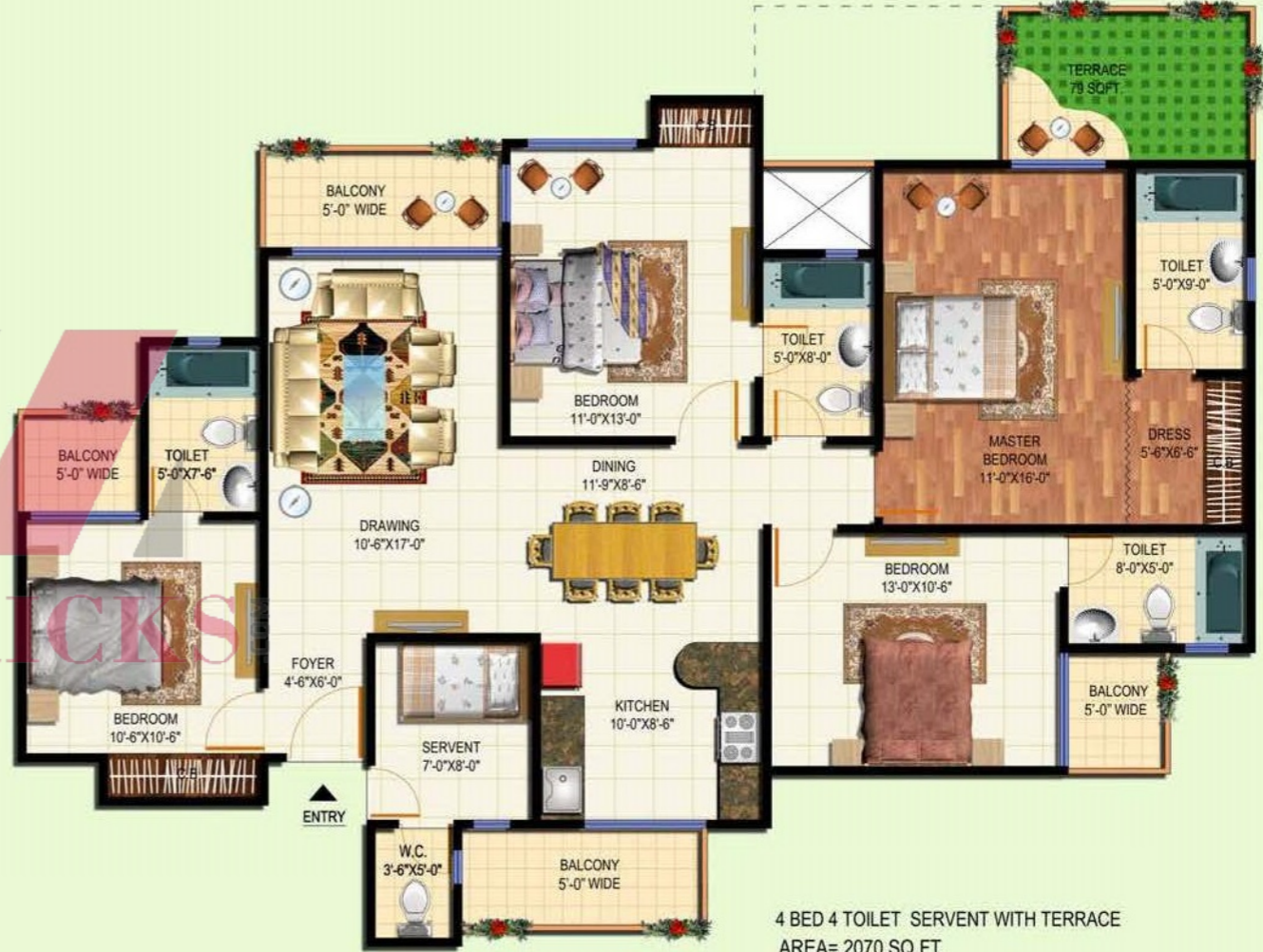
4 BED 4 TOILET SERVANT WITH TERRACE AREA= 2070 SQ.FT.