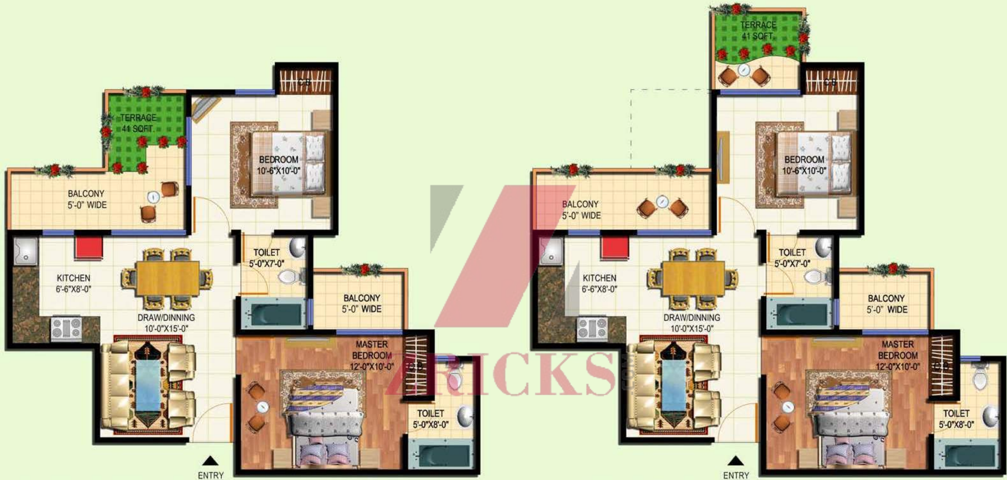
2 BED 2 TOILET WITH TERRACE AREA= 885 SQ.FT.