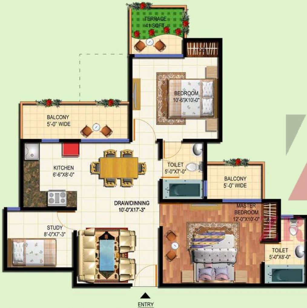
2 BED 2 TOILET STUDY WITH TERRACE AREA= 990 SQ.FT.