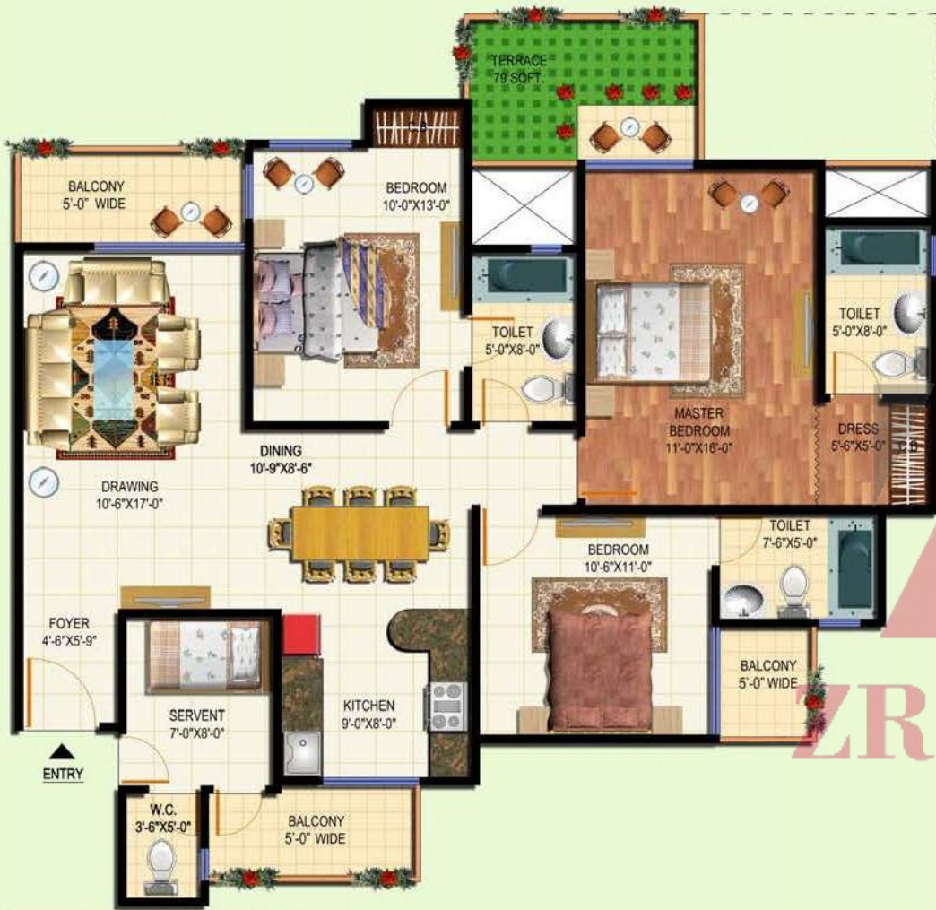
3 BED 4 TOILET SERVENT WITH TERRACE AREA= 1700 SQ.FT.