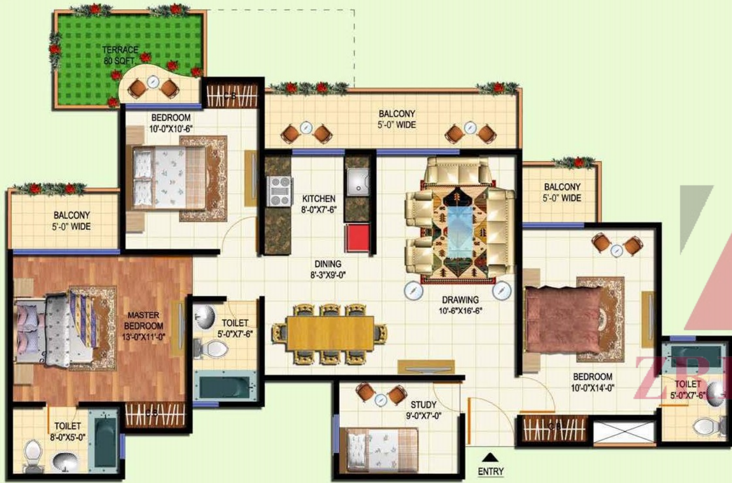
3 BED 3 TOILET WITH TERRACE AREA= 1600 SQ.FT.