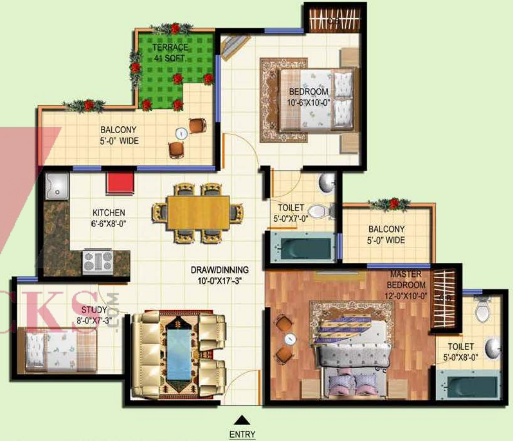
2 BED 2 TOILET STUDY WITH TERRACE