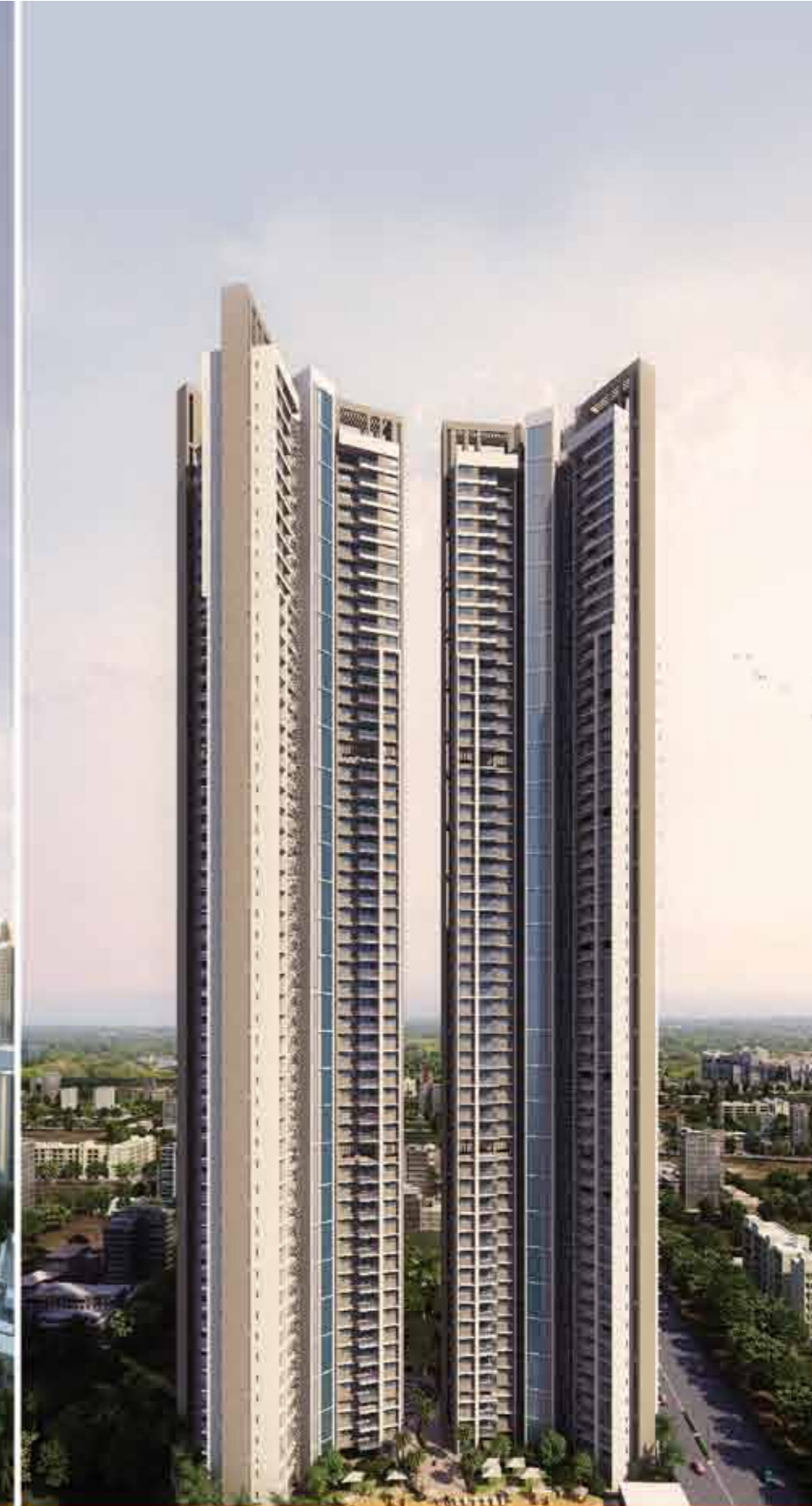
ALPINE, KANDIVALI (E)