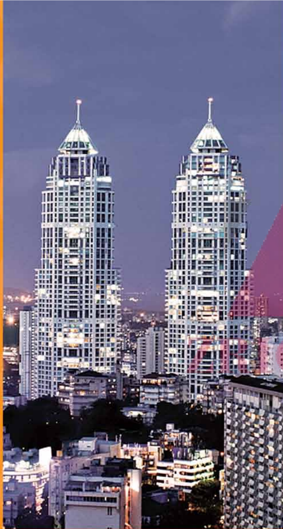
THE IMPERIAL, TARDEO

With a single dream in mind, two stalwarts, Shapoorji Pallonji and the Dillip Thacker Group, joined forces to form SD Corp. The sole purpose of the partnership was to redefine the construction industry in Mumbai and build homes that live up to the expectations of its citizens. Together they have given shape to one of India's tallest residential towers - The Imperial, and are currently focusing on redefining the western suburbs. The Lumière is one such project that will begin a new phase in the history of SVP Nagar so that SVP Nagar will never be the same again.