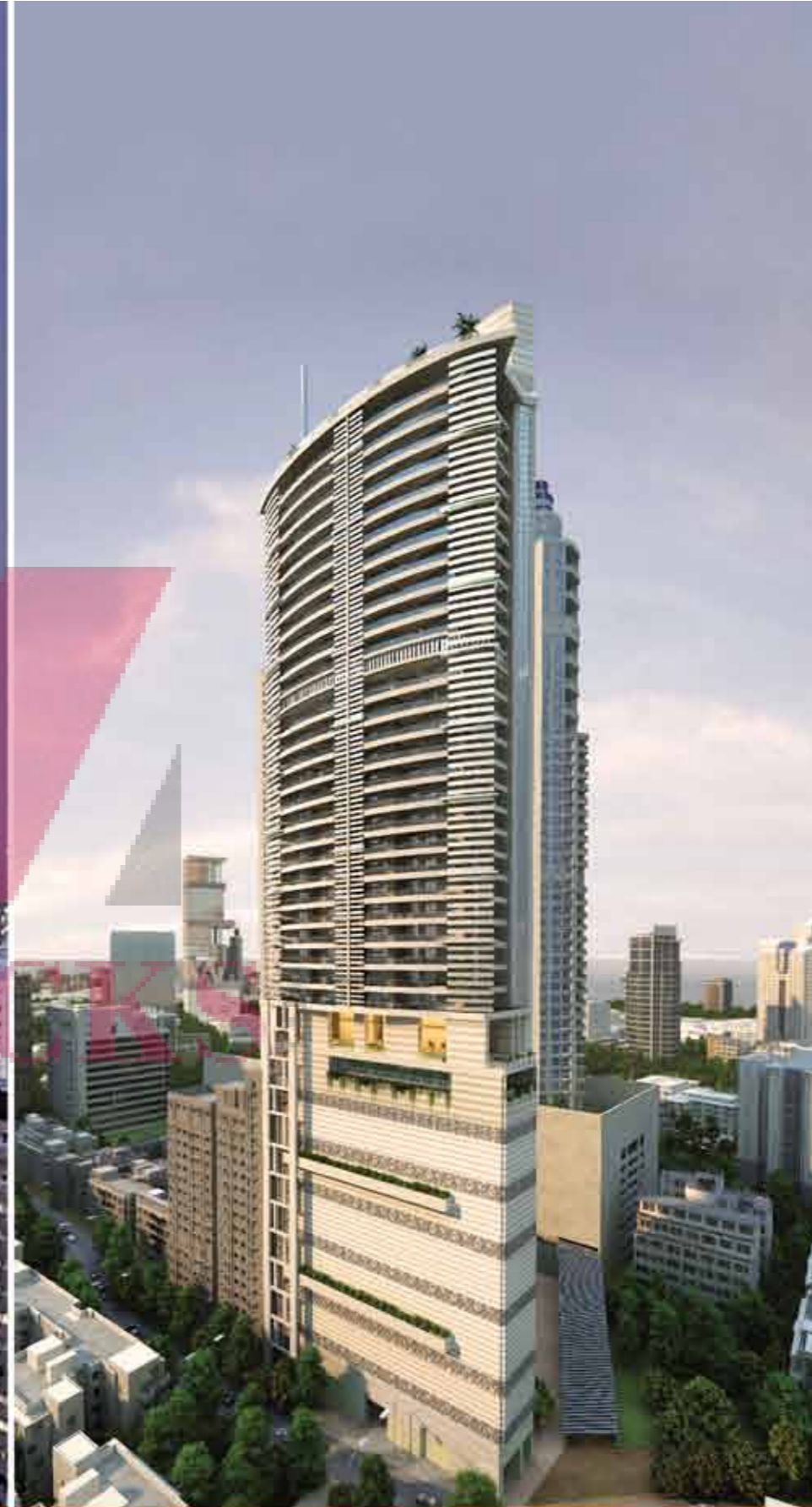
FIVE IMPERIAL EDGE, TARDEO