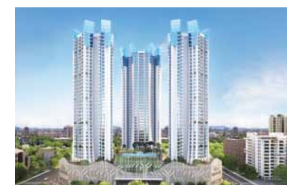
EKTA TRIPOLIS 36 storey residential tower with 2, 3 & 4 BHK luxury apartments at Goregaon (W).