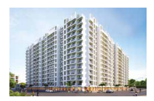
EKTA PARKSVILLE 15 storey residential towers with 1, 2 & 3 BHK Classic and Platinum apartments at Virar (W).