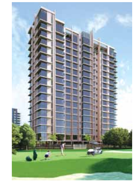
PANORAMA 16 storeyed residential building with 3 & 4 BHK premium apartments in Chembur.