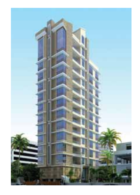
LÈGRANZ A residential tower with 4 BHK ultra-luxurious apartments in Chembur.