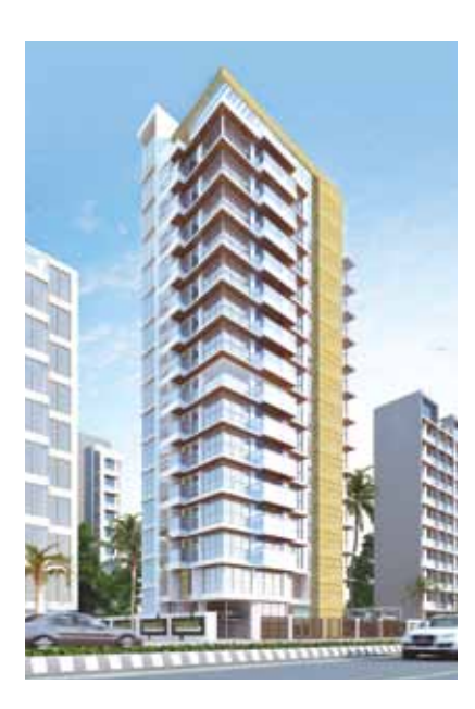
ESTRELLA 14 storey residential towers with 4 BHK iconic residences at Bandra (W).