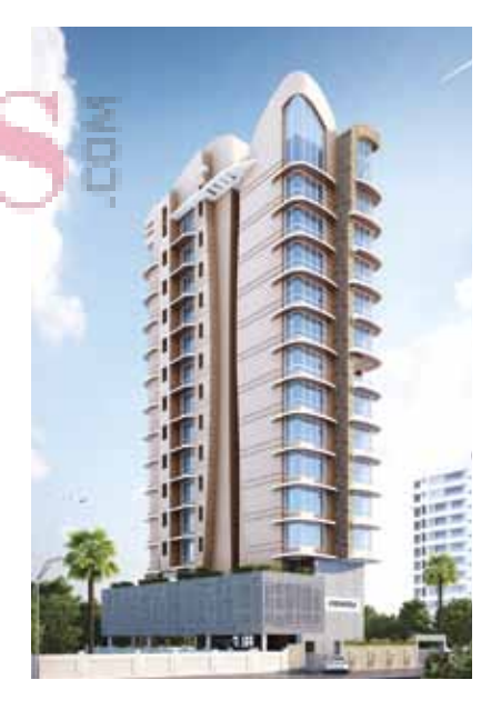
EUDORA 14 storey residential tower with 4 BHK lavish apartments at Khar (W).