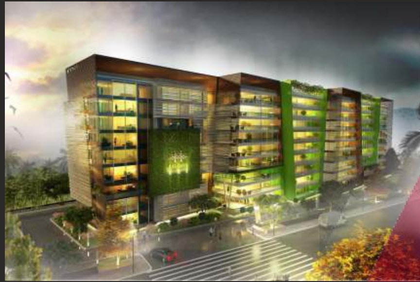
Halcyon - Hyderabad

Golf Edge winner of the "Best Residential Project in the Luxury Segment"- Hyderabad City