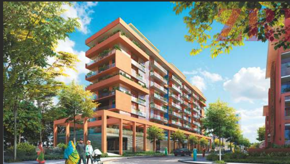
PREMIUM GARDEN APARTMENTS