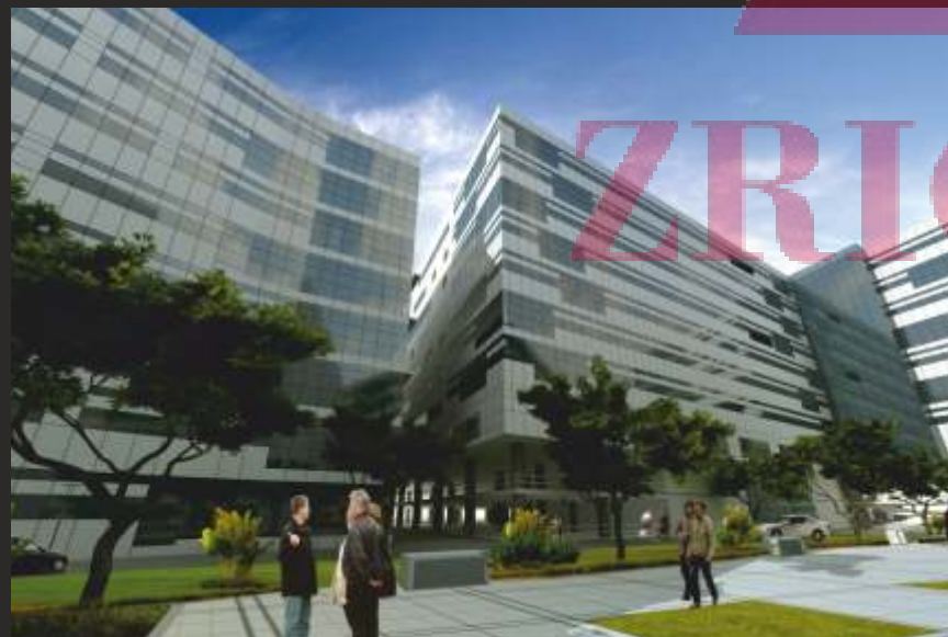
Avance Business Hub (IT SEZ) Hyderabad