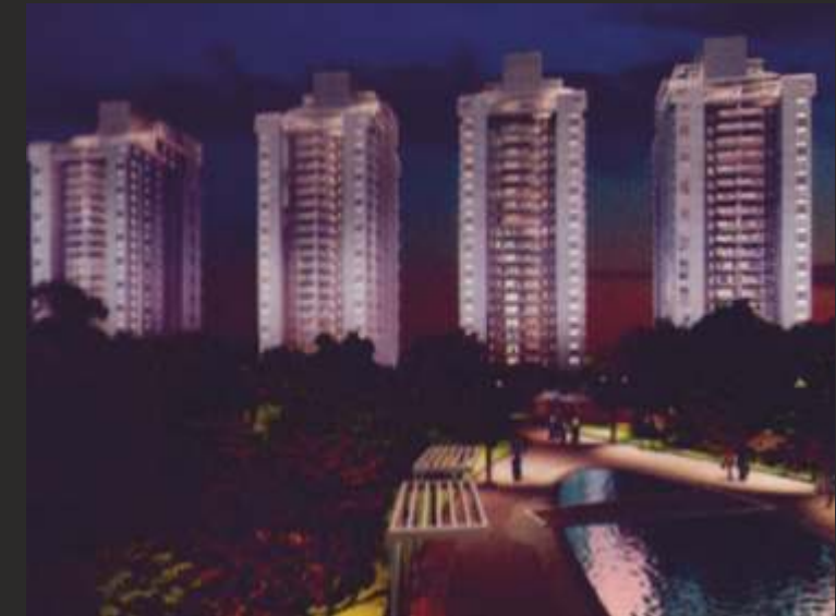
One & Only