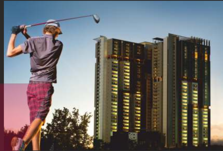
Golf Edge - Hyderabad