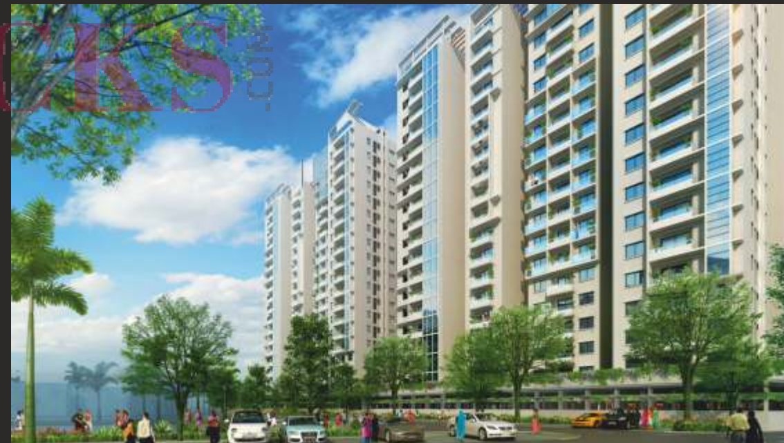
HIGH RISE APARTMENTS