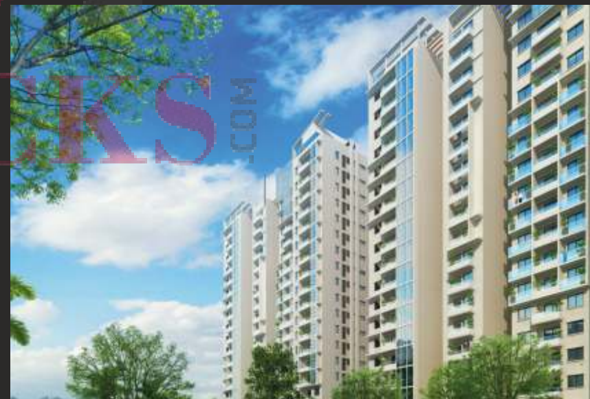
The Village, Chennai