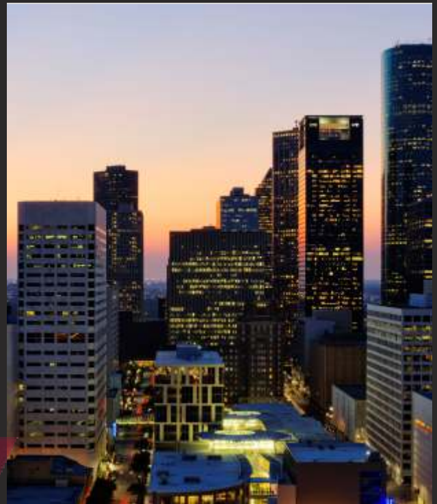
Thane: The city of the future