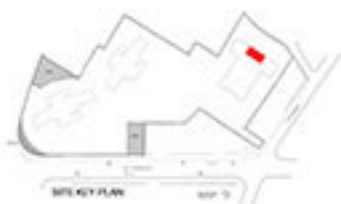
SITE KEY PLAN